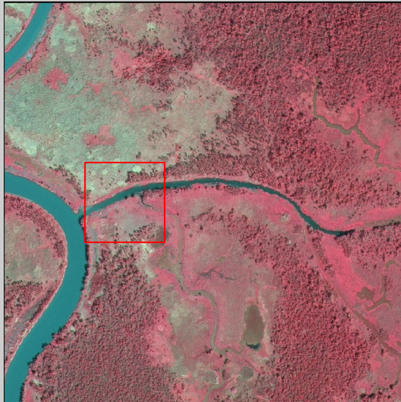
2005 Land-Water Classification