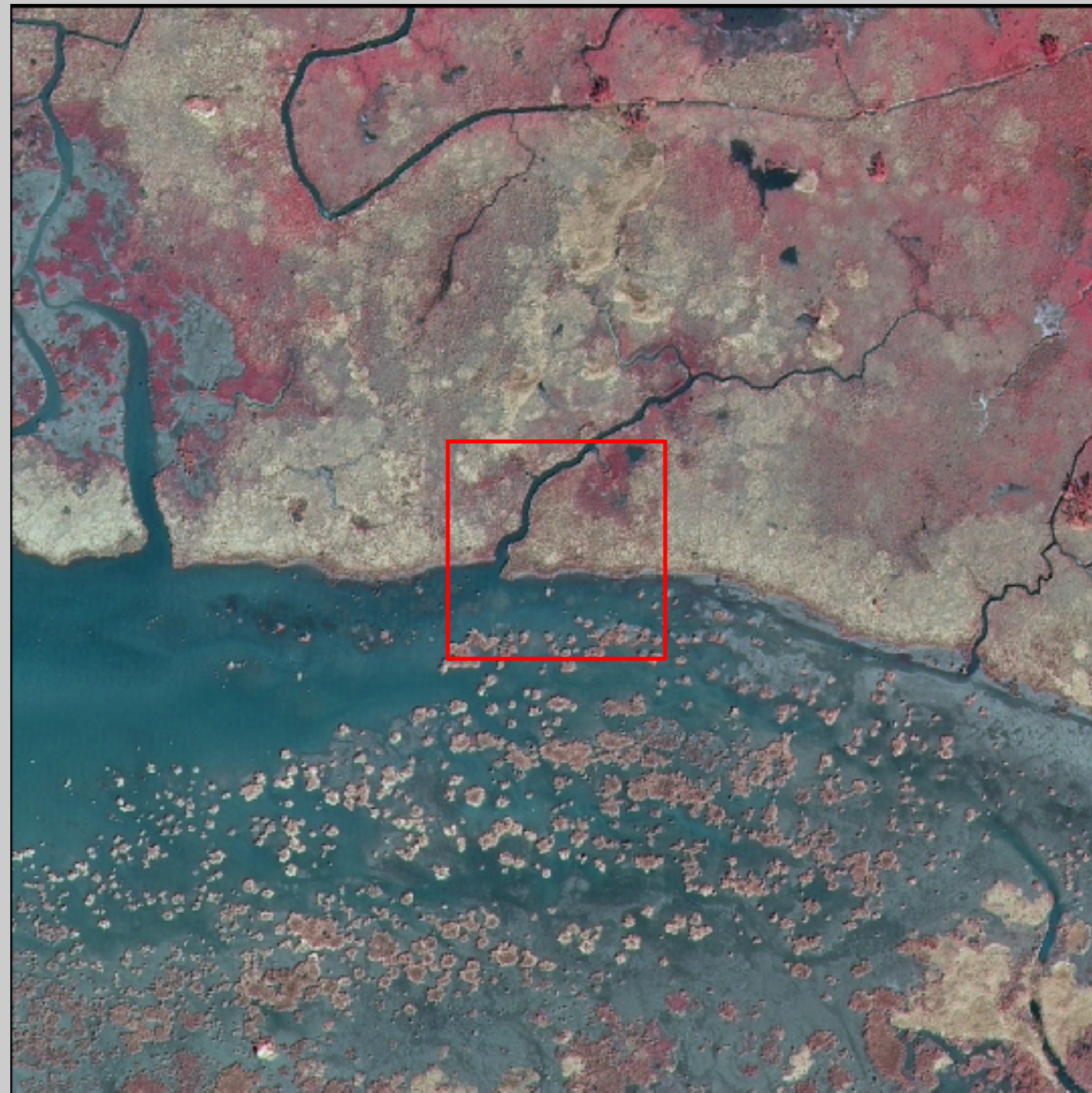
2005 Land-Water Classification