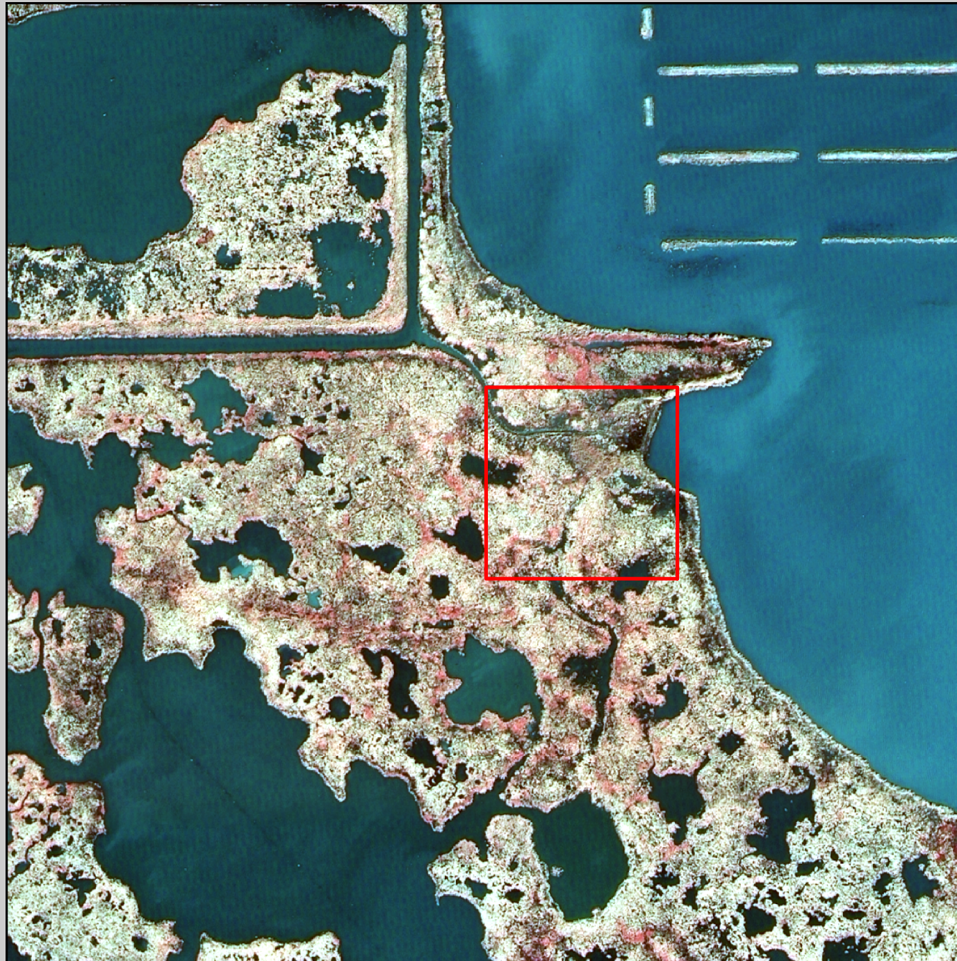
2005 Digital Image