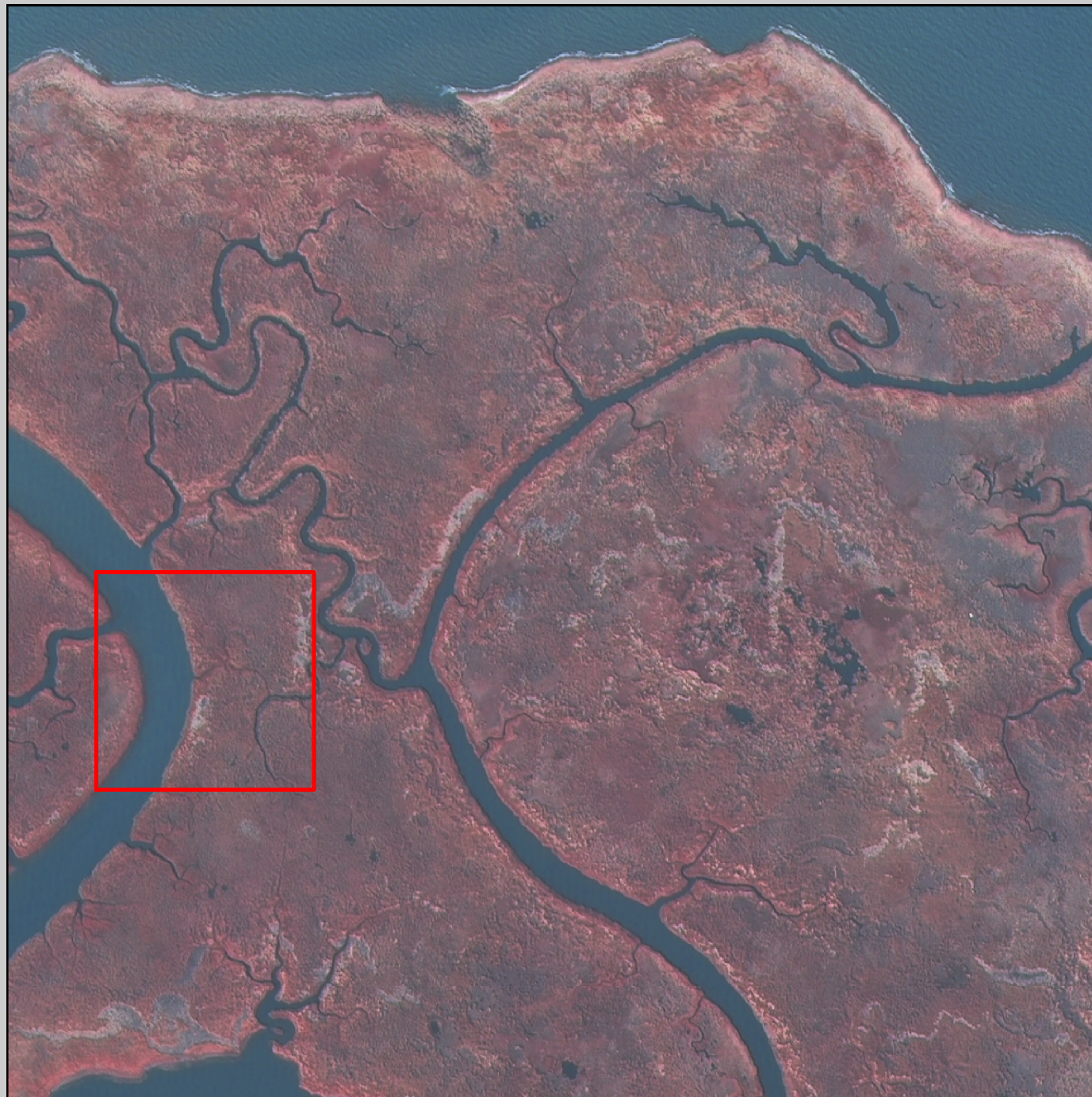
2005 Digital Image