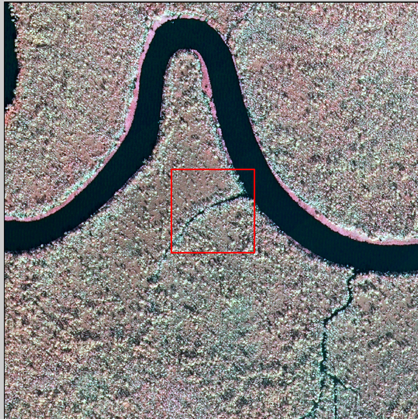
2005 Land-Water Classification