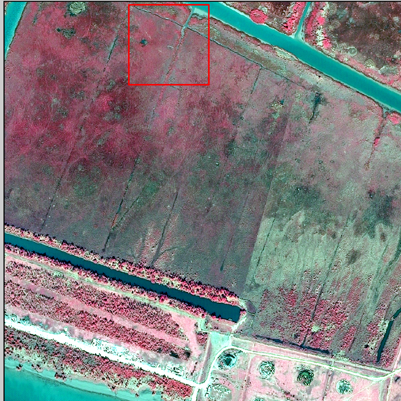
2008 Digital Image