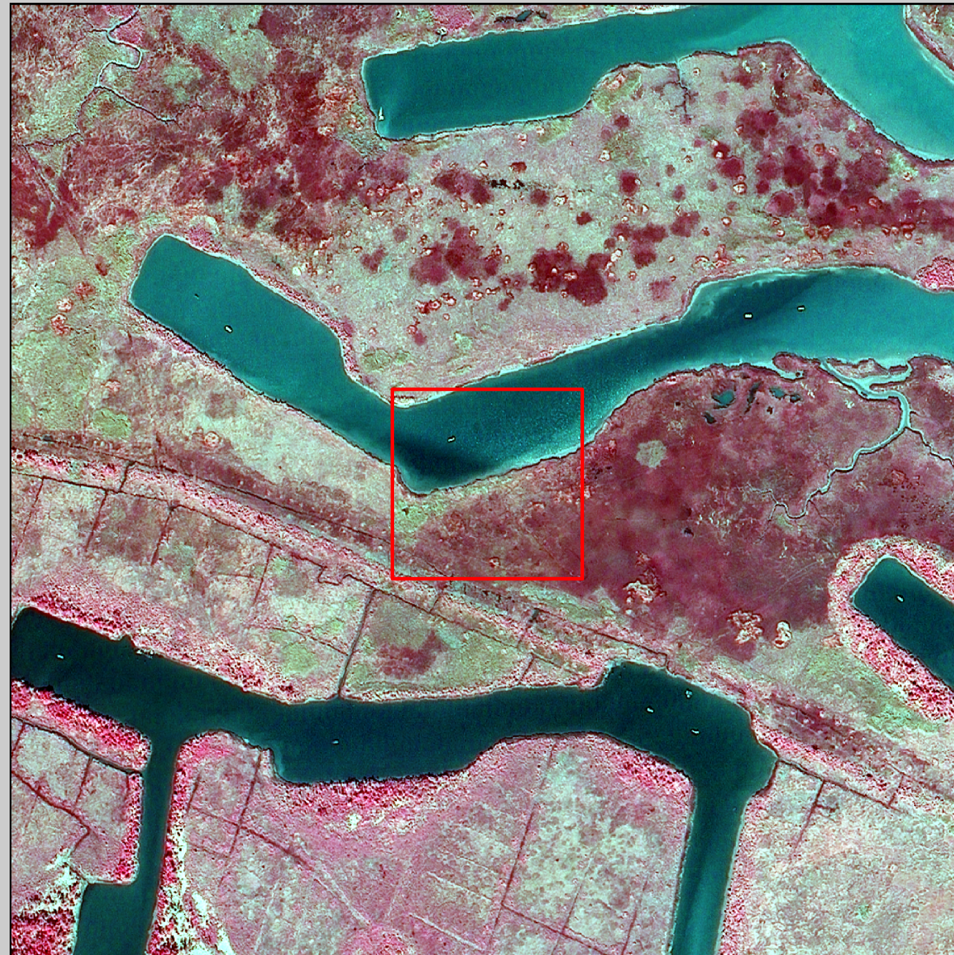
2008 Land-Water Classification