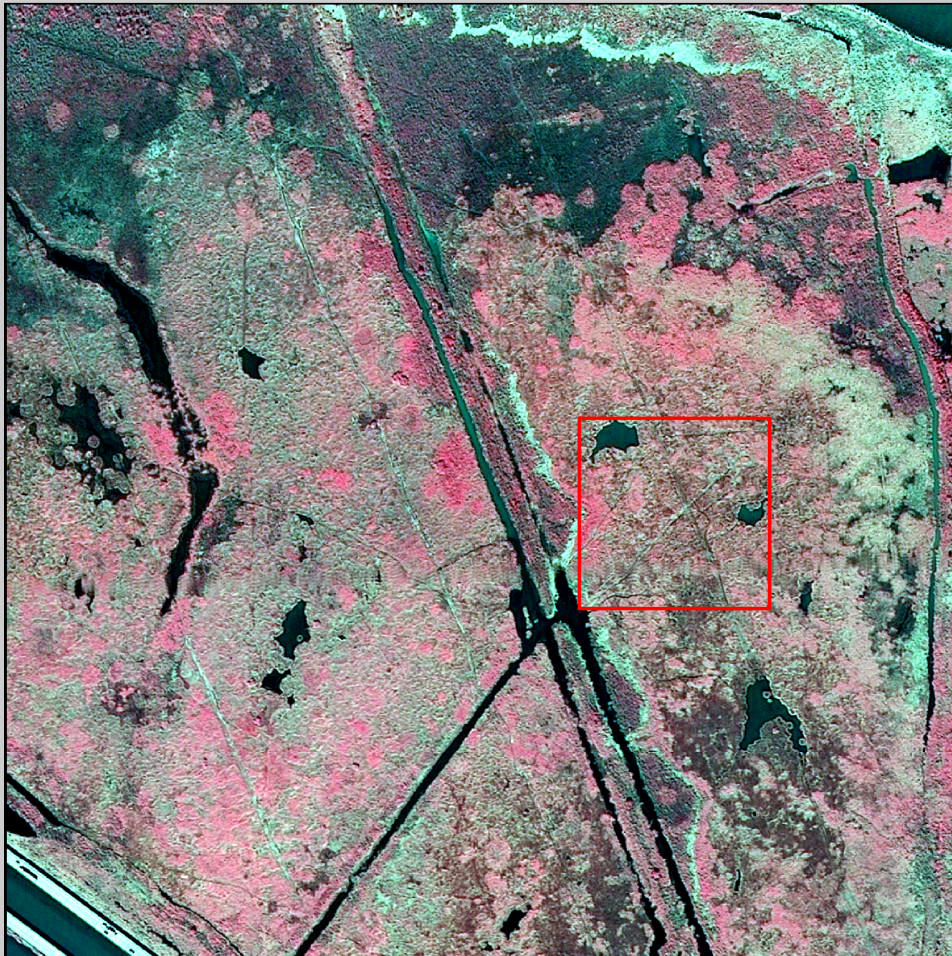
2008 Digital Image