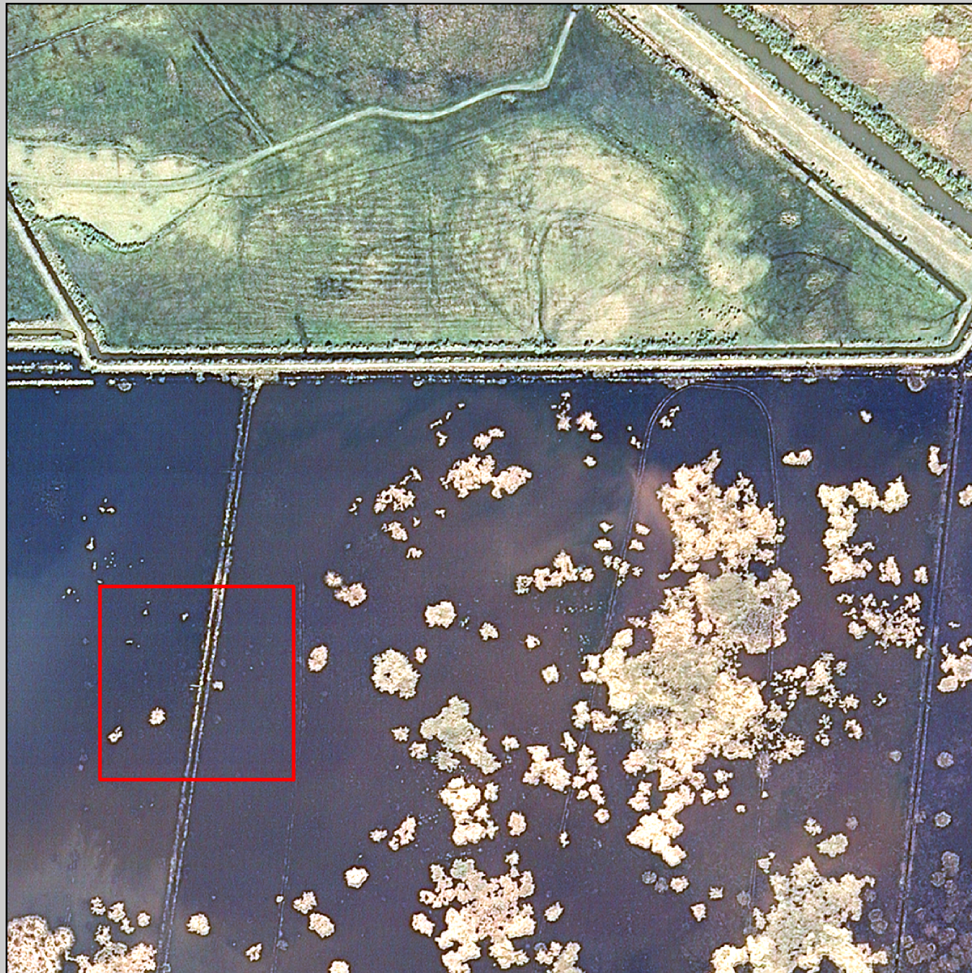
2008 Digital Image