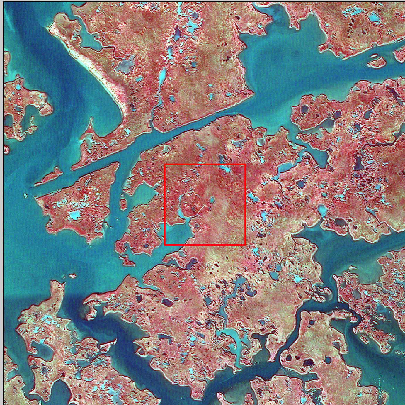
2008 Land-Water Classification