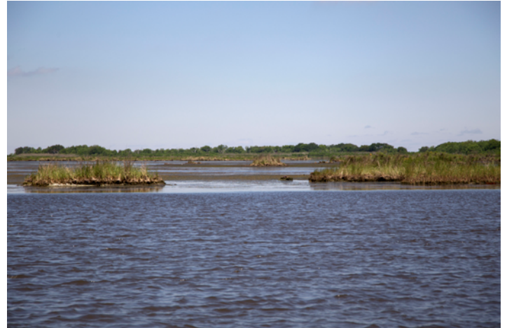
Degraded marsh in coastal Louisiana.

Sediment will be hydraulically dredged from the Mississippi River. The dredged riverine sediments will be pumped via pipeline into two semi-confined disposal areas. Where feasible, existing marsh will be used as containment instead of containment dikes.