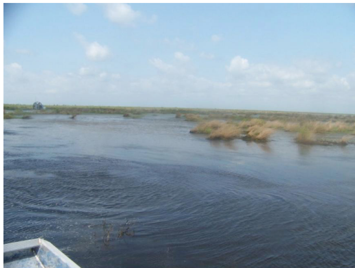
View of project receiving area; perspective taken from open water towards marsh edge.

Sediment will be hydraulically dredged from the Gulf of Mexico and pumped via pipeline to create approximately 380 acres of marsh (295 acres confined disposal and 85 acres unconfined disposal). Funds are included to plant approximately 180 acres. Approximately 12,150 linear feet of earthen terraces will be constructed in a sinusoidal layout to reduce fetch and wind-generated wave erosion. Terraces will be constructed to +3.0 feet NAVD88, 15 feet crown width, and planted. Terrace acreage will result in four acres of marsh above Mean Low Water.