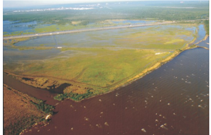
Aerial view looking north depicting the marsh created within the Bayou LaBranche project area. Lake Pontchartrain is in the foreground, U.S. Interstate 10 can be seen running east to west near the top, and the emergent marsh (open water prior to 1994) is the large, vegetated area in the center.

Project effectiveness was evaluated by monitoring emerging wetland vegetation growth, water quality, and both the elevation and compaction rates of the deposited sediment.