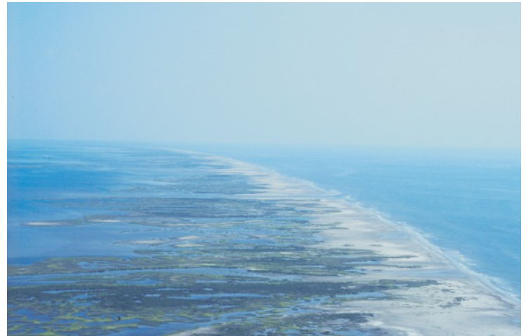
Aerial view of the Chandeleur Islands.

Federal Sponsor: National Marine Fisheries Service Baton Rouge, LA (225) 389-0508