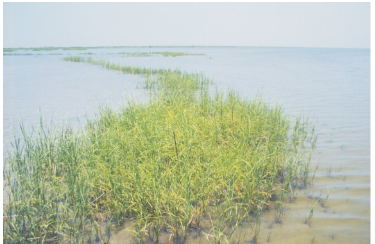
The plantings of smooth cordgrass shown above are thriving.