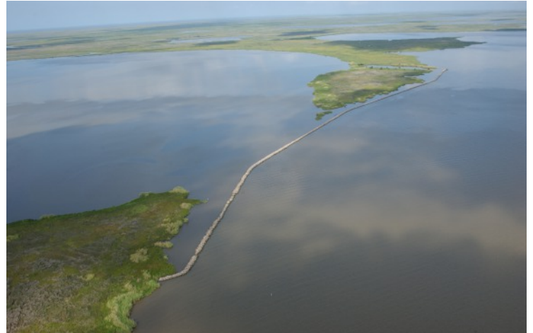
Project features include shoreline protection, canal closures, and isolation of Lake Sand from Vermilion Bay with a rock dike on the northeastern edge of Marsh Island. View is looking west.

The project increases marsh, fish, and wildlife productivity by reducing shoreline erosion and correcting altered hydrology.