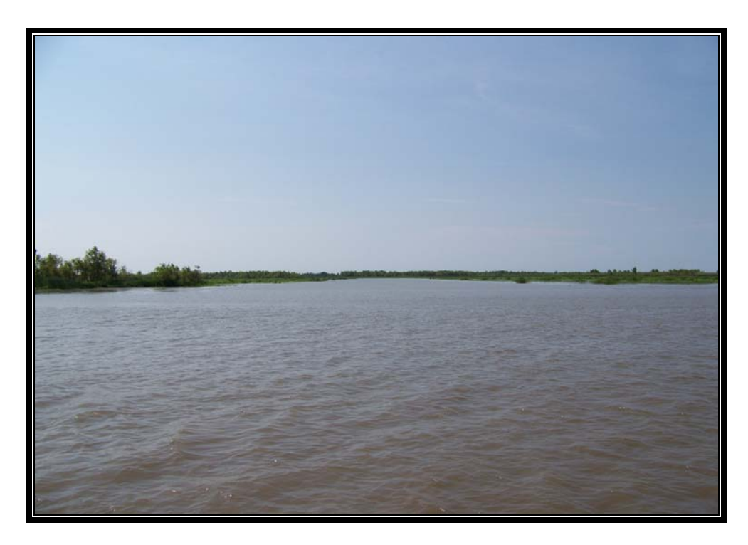
Photo\ No.7-(AT-03)-view\ of\ Channel\ "E"\ near\ the\ intersection\ of\ Channel\ "A"\ looking\ southeast.