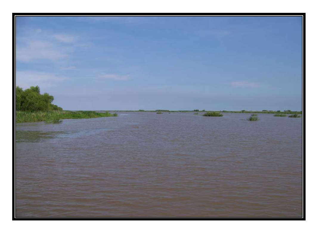
Photo No.4 – (AT-03) – view of Channel "D" from Sta. 15+00 looking northwest.