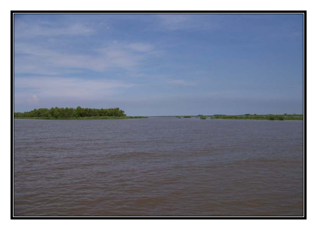
Photo No.3 – (AT-03) – view of Channel "D" looking northwest near the intersection of Channel "A"