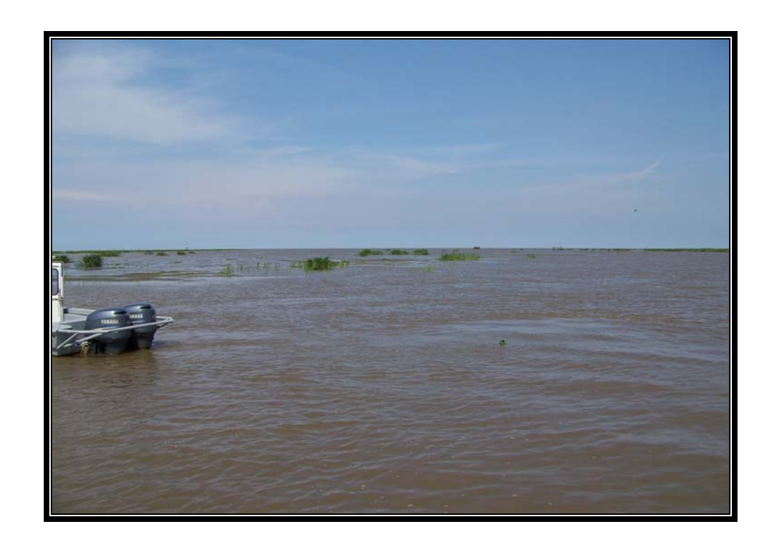
Photo No. 11 – (AT-03) – view of aquatic vegetation on the southwest side of Channel "F".