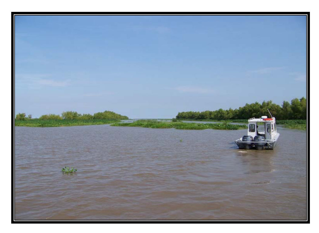
Photo No.5 – (AT-03) – view of Channel "B" from Sta. 5+00 looking northwest.