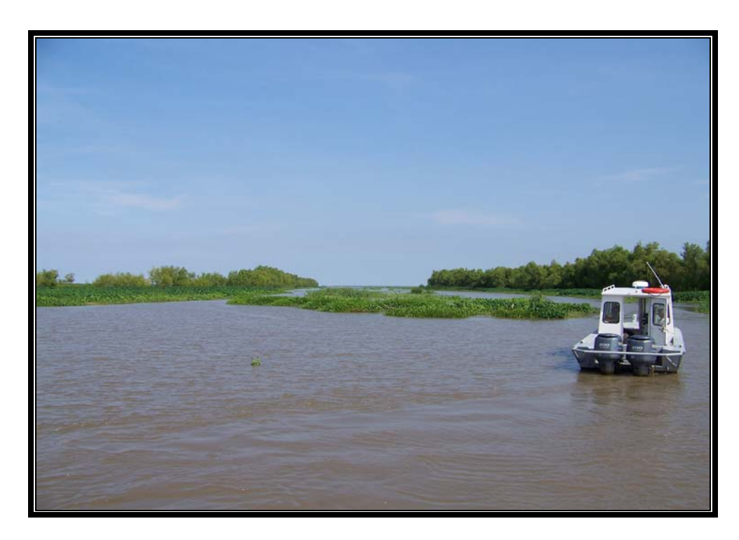
Photo No.6 – (AT-03) – another view of channel "B" from Sta. 5+00 looking southwest.