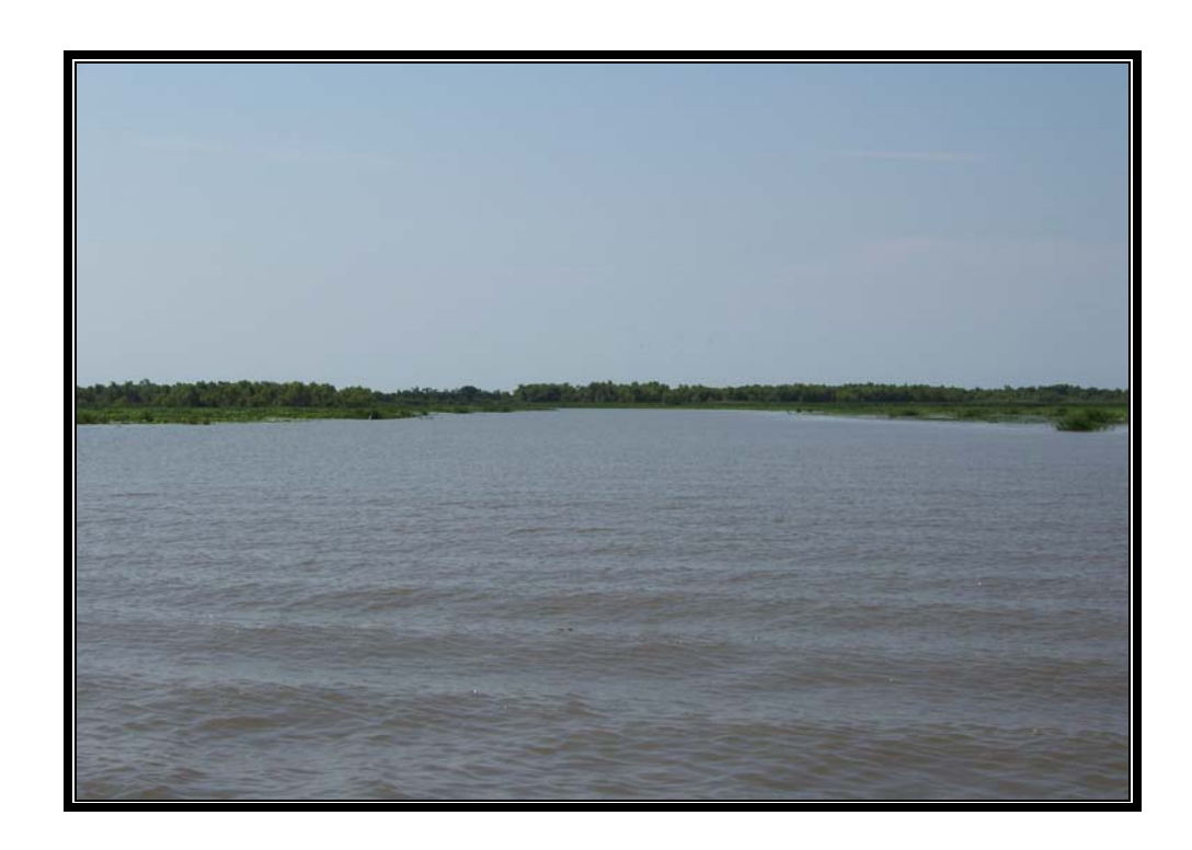
Photo No.8 - (AT-03) - view of Channel "E" near Sta. 10+00 looking southeast.