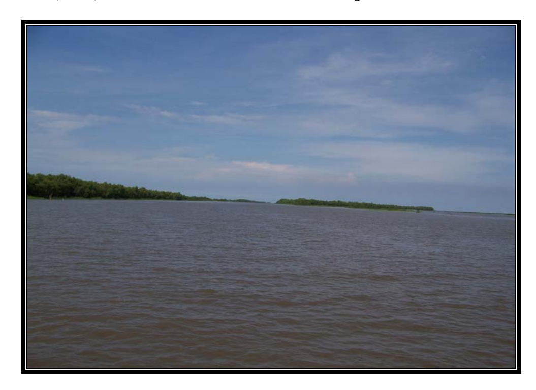
Photo\ No.2-(AT-03)-view\ looking\ southwest\ along\ Channel\ "A"\ near\ the\ intersection\ of\ Channel\ "D".