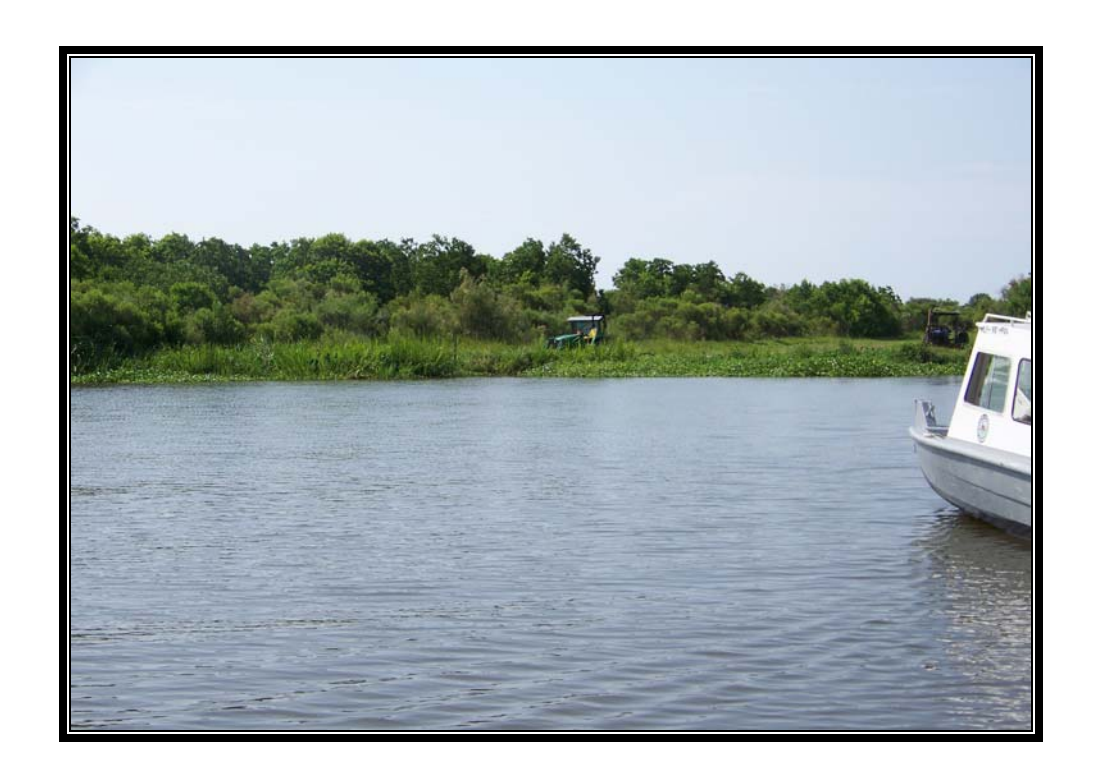
Photo No.9 – (AT-03) – view of the cul-da-sac at the end of Channel "E" looking southeast.