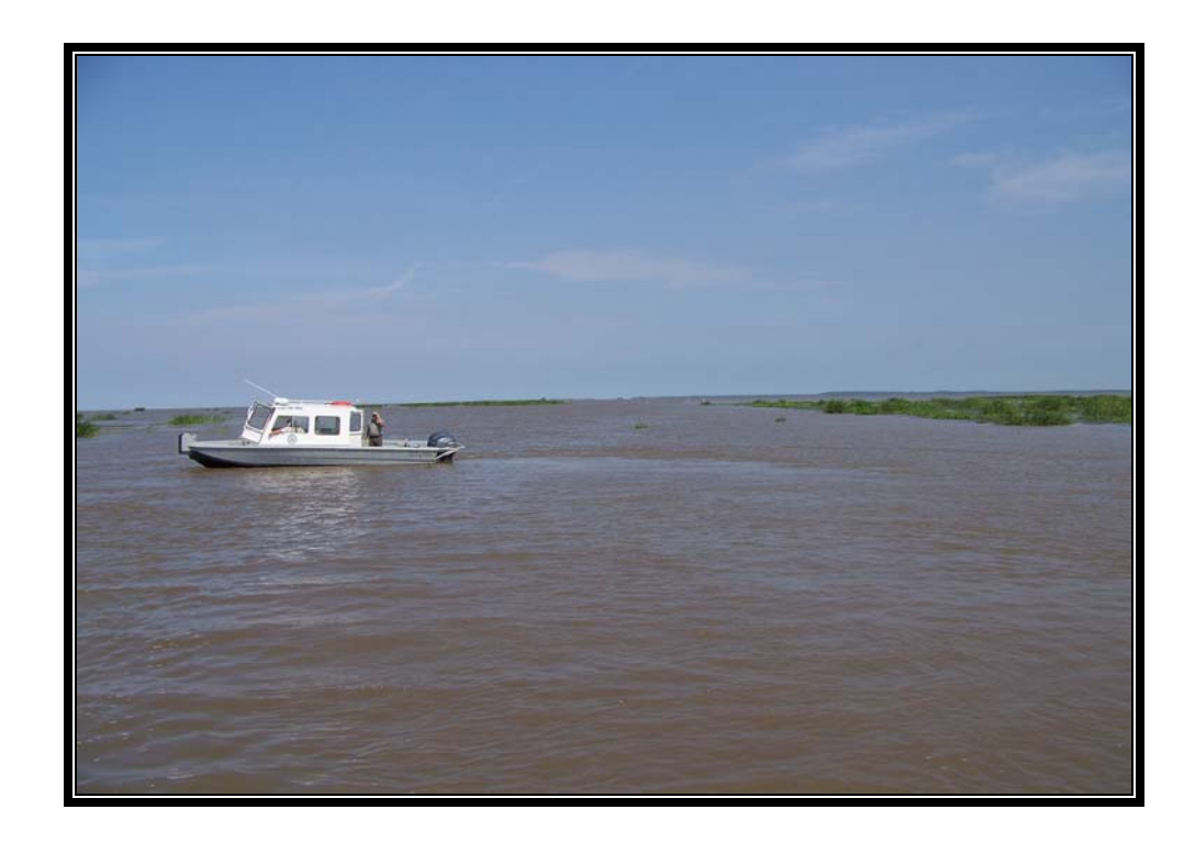
Photo No.10 – (AT-03) – view of Channel "F" near Sta. 5+00 looking northwest.