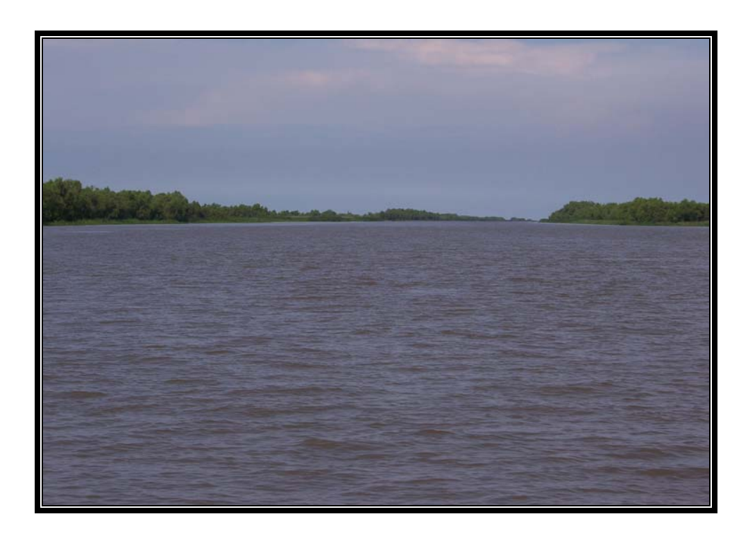
Photo\ No.1-(AT-03)-view\ of\ Channel\ "A"\ near\ Sta.\ 50+00\ looking\ southwest\ downstream.