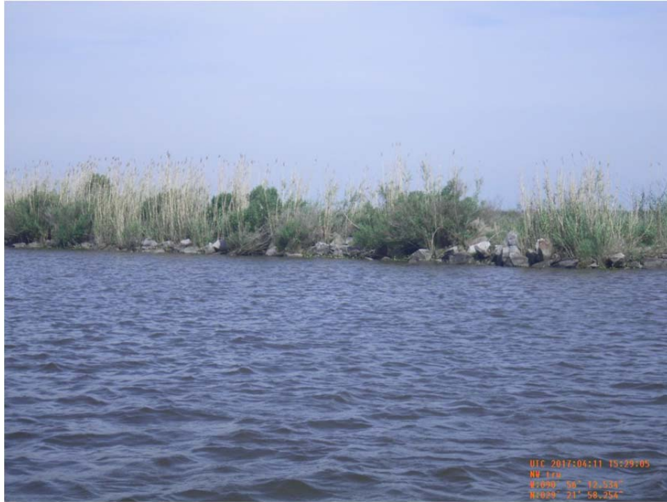
Photo No.5 – view of the rock dike shoreline repair (Breach Repair 1-4) located along the north bank of Bayou de Cade.