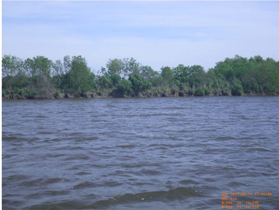
Photo No.19 – view of the earthen embankment along the north bank of Jug Lake east of Structure 21.