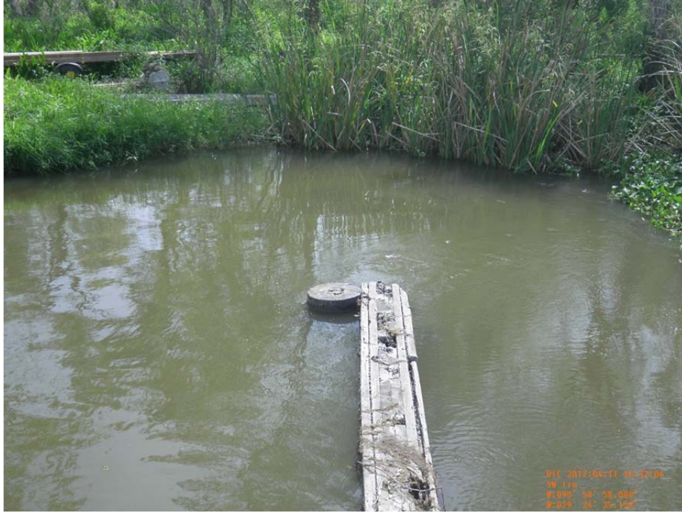
Photo No.51 – view of the existing timber bulkhead along the oilfield canal at the intersection of Brady Canal and Carencro Bayou.