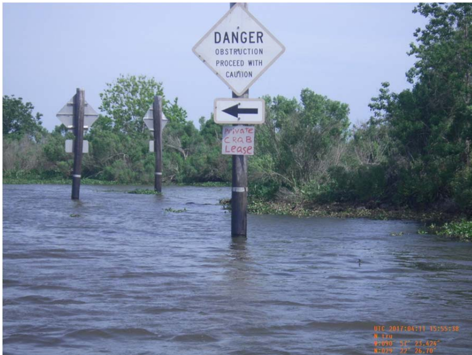
Photo No.28 – view of the north riprap to bank tie-in on Structure 20.