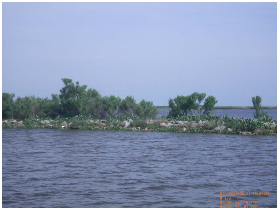
Photo No.36 – view of rock revetment along the north bank of Bayou de Cade between Structures 6 and 7.