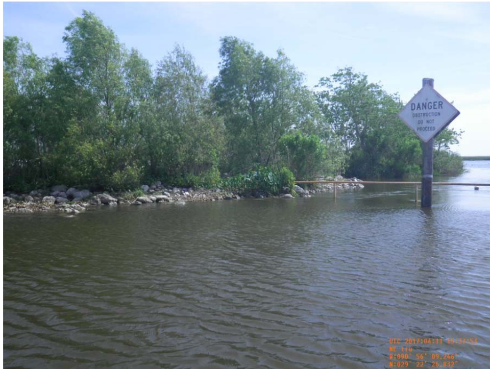
Photo No.13 – view of the north bank rip rap tie-in of Structure 24.