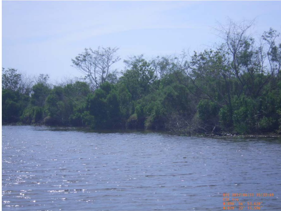
Photo No.9 – view of the earthen embankment along the south bank of Jug Lake.