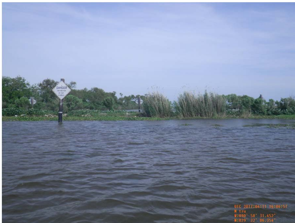
Photo No.38 – view of rock plug 7 along the north bank of Bayou de Cade.