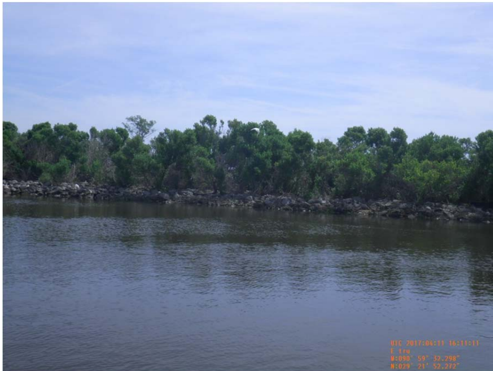
Photo No.42 – view of rock revetment along the east bank of Voss Canal south of Structure 10.