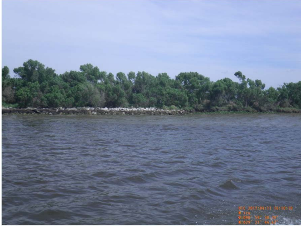
Photo No.41 – view of rock revetment along the north bank of Bayou de Cade at Voss Canal.