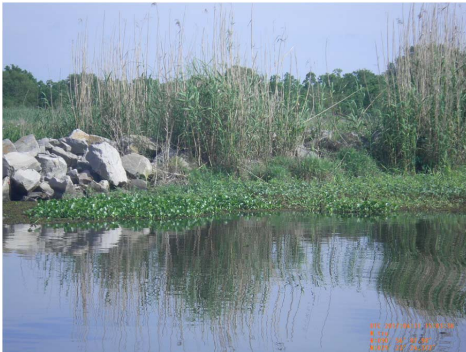
Photo No.2 – view of bank tie-in of rock plug on the northeast side of the structure. This structure was completed in 2003 and is designated as Breach 7 on the project map.