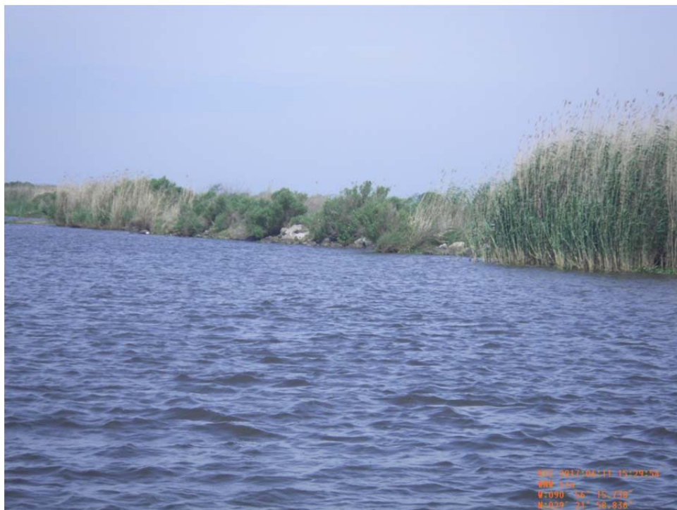
Photo No.6 – view of the rock dike shoreline repair (Breach Repair 1-4) located along the north bank of Bayou de Cade.