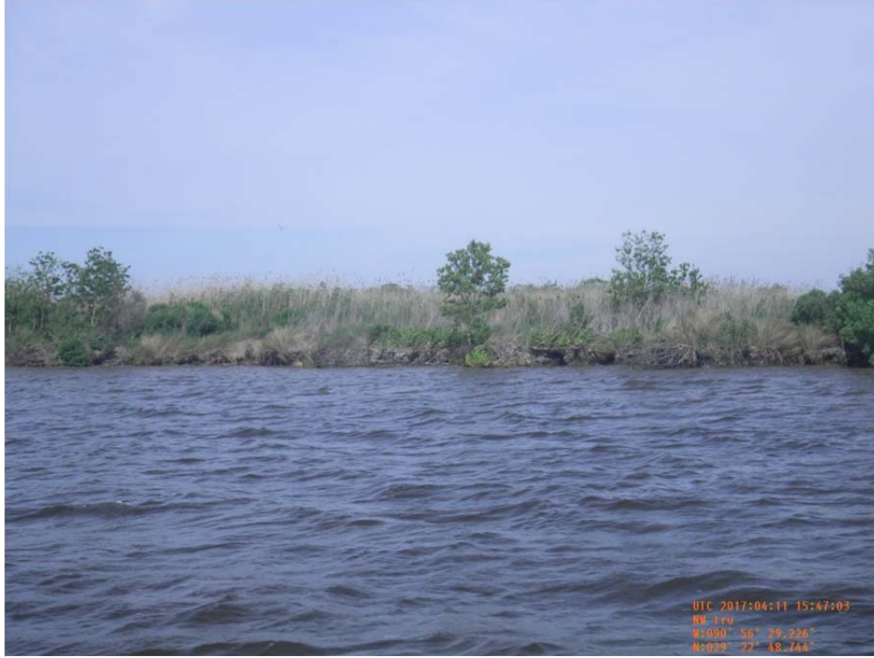
Photo No.21 – view of the earthen embankment along the north bank of Jug Lake east of Structure 21.