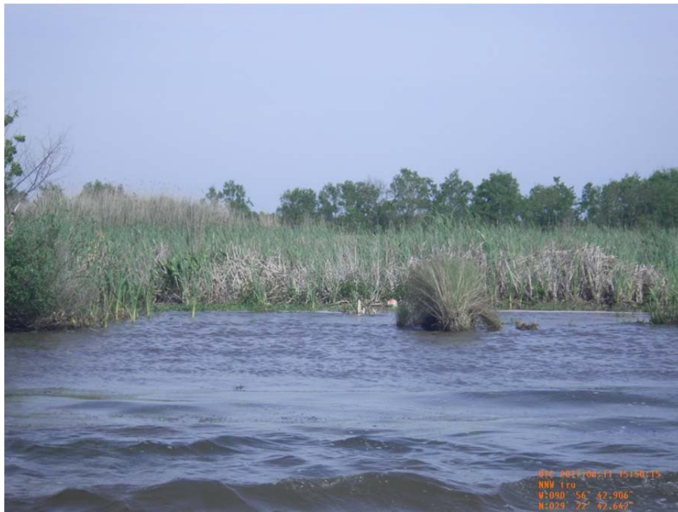
Photo No.26 – view of the existing shoreline along the north bank of Jug Lake between Structures 21 and 20.