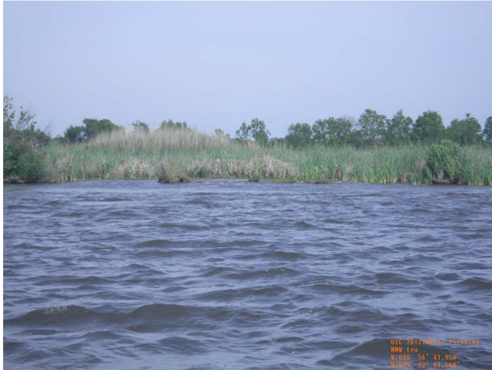
Photo No.25 – view of the existing shoreline along the north bank of Jug Lake between Structures 21 and 20.