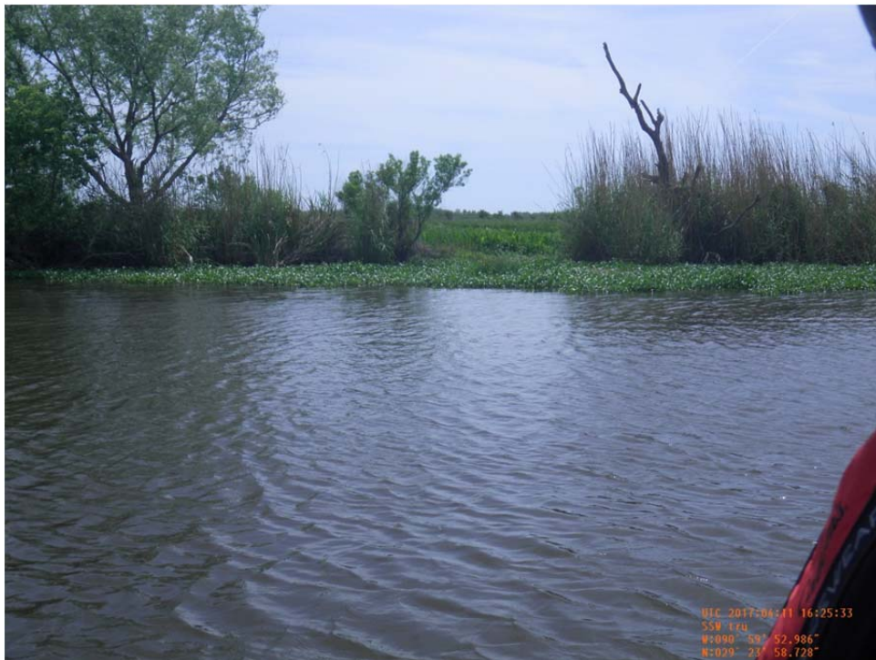
Photo No.50 – view of a breach in the overflow bank along Carencro Bayou north of Structure 14.