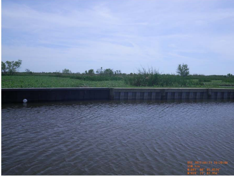
Photo No.45 – view of southern end of steel sheetpile wall at Structure 14.