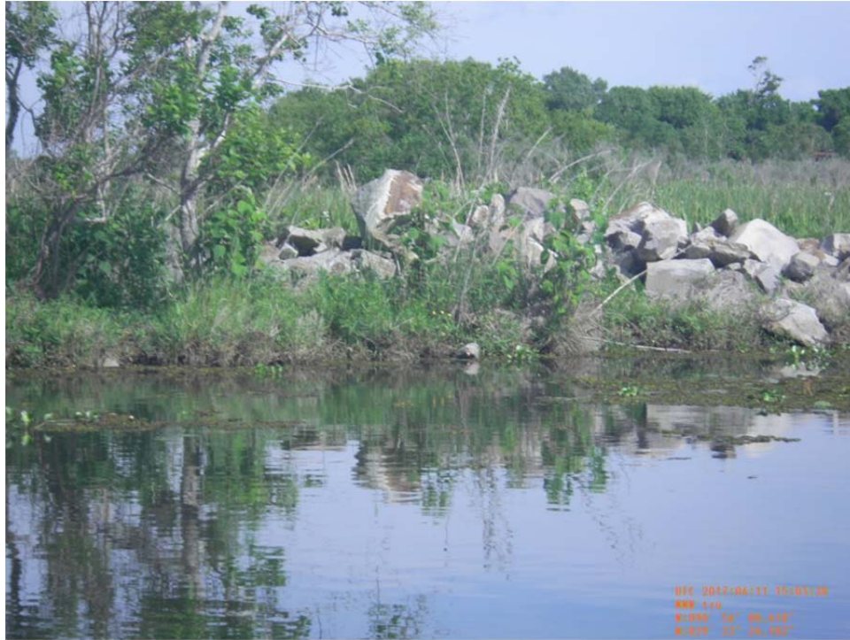
Photo No.3 – view of bank tie-in of rock plug on the southwest side of the structure. This structure constructed in 2003 and is designated as Breach 7 repair on the project map.