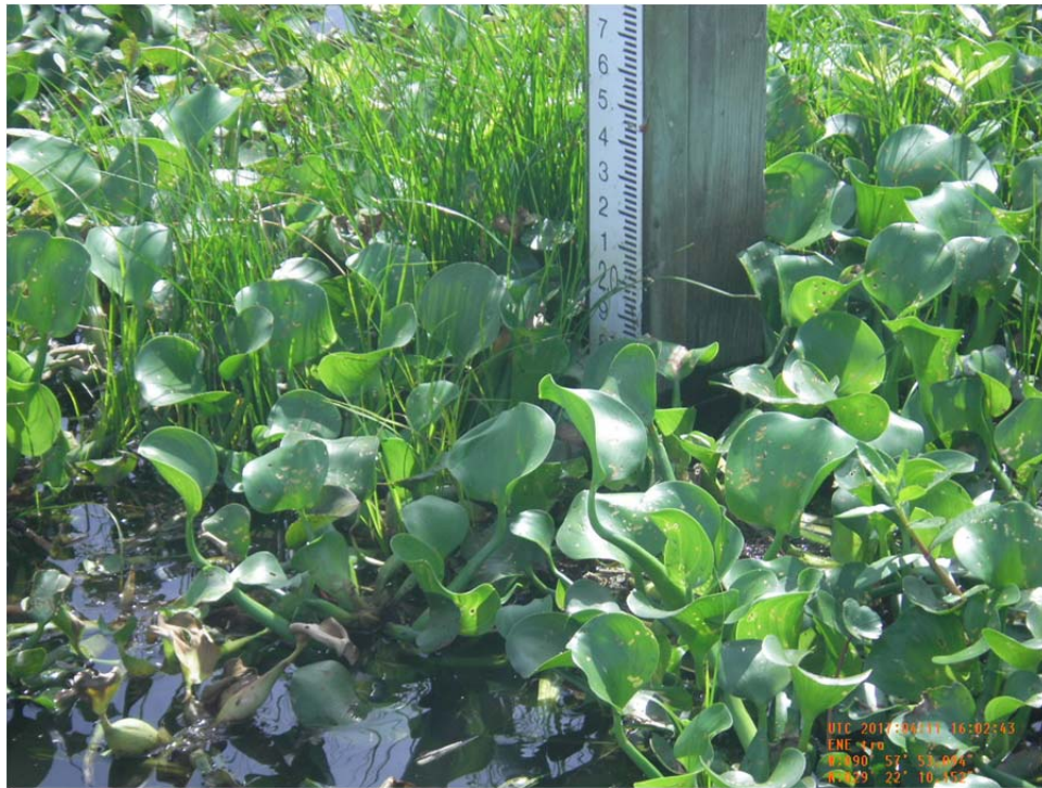
Photo No. 35 – view of the staff gauge on the CRMS data recorder just north of Structure 6.