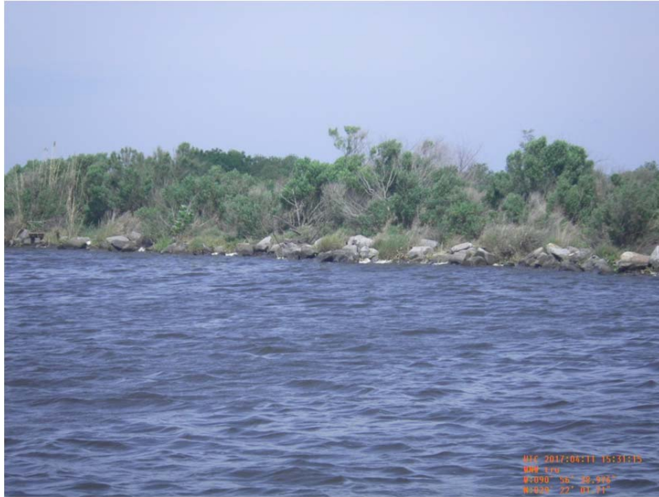
Photo No.7 – view of the rock dike shoreline repair (Breach Repair 1-4) located along the north bank of Bayou de Cade.