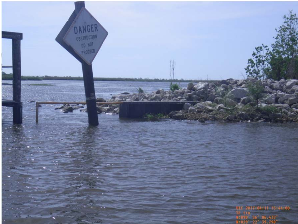
Photo No. 18 – view of the south bank riprap tie-in of Structure 23.