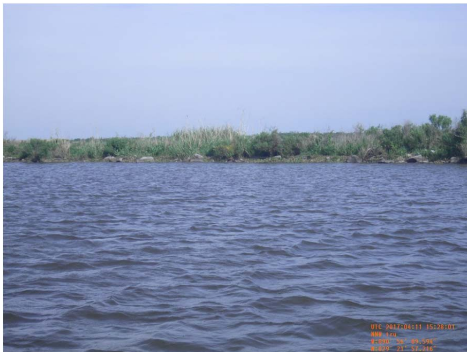
Photo No.4 – view of east section of the rock dike shoreline repair constructed in 2003 along the north bank of Bayou de Cade. This structure is designated as Breach 1-4 on the project map.