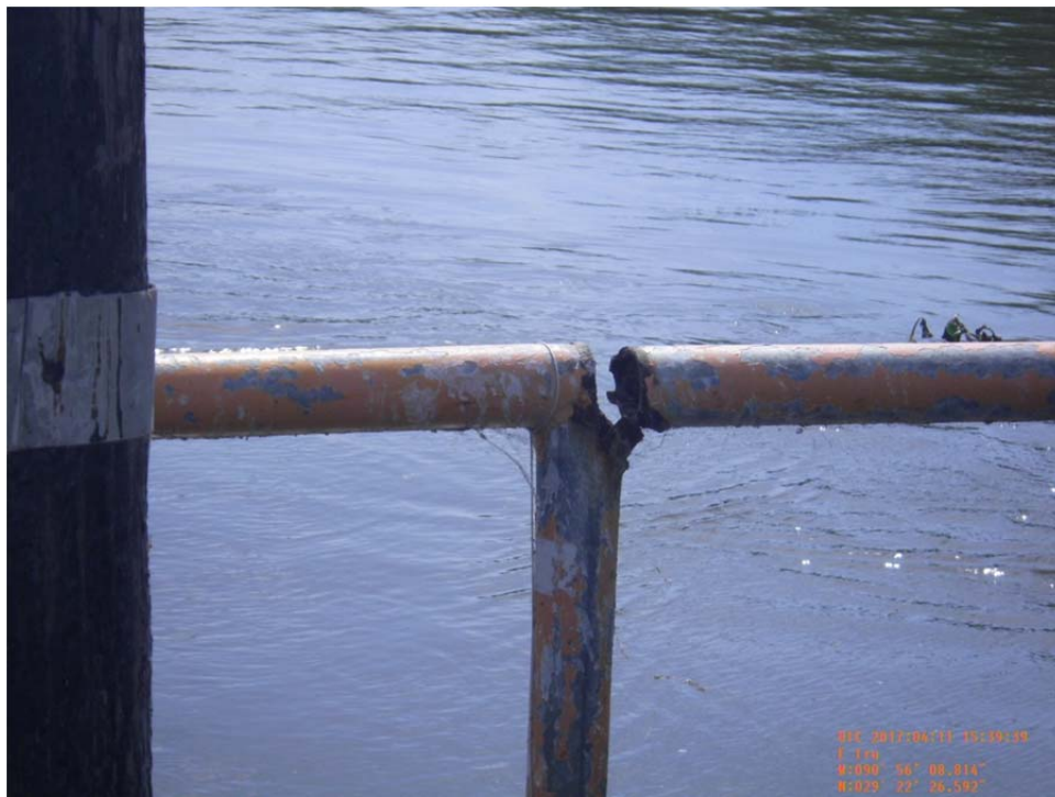
Photo No.14 – view of a break in the steel pipe hand rail on the south side of Structure 24.