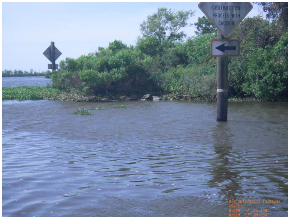
Photo No.30 – view of the south riprap to bank tie-in on Structure 20.