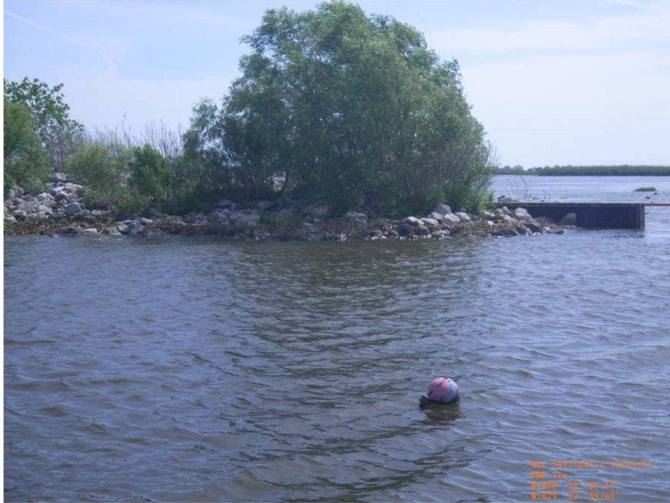
Photo No. 17 – view of the north bank riprap tie-in of Structure.23.