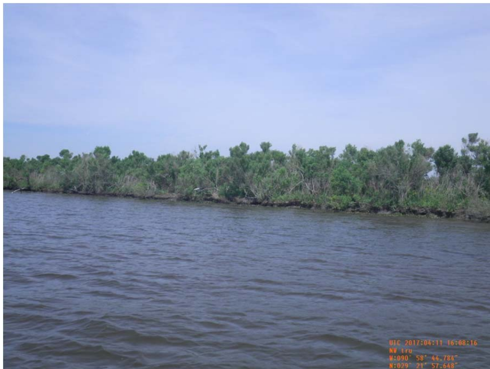
Photo No.40 – view of existing shoreline along the north bank of Bayou de Cade between Structure 7 and Voss Canal.