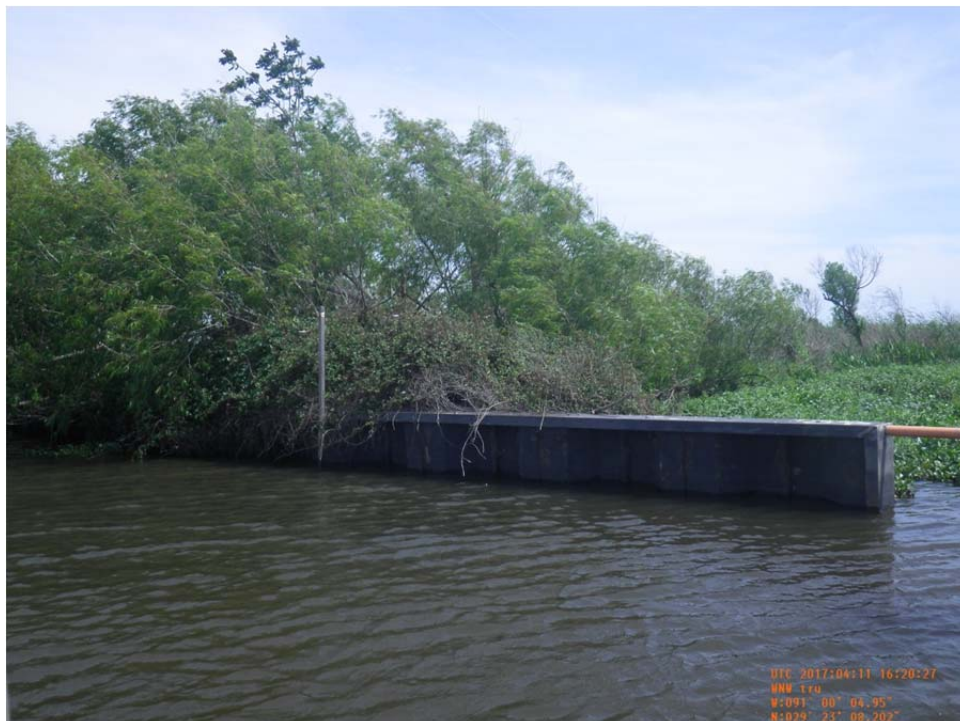
Photo No.48 – view of northern end bank tie-in of steel sheetpile wall at Structure 14.