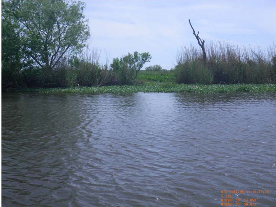
Photo No.49 – view of a breach in the overflow bank along Carencro Bayou north of Structure 14.