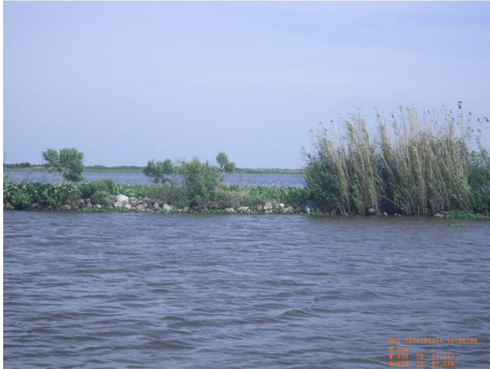
Photo No.37 – view of rock revetment along the north bank of Bayou de Cade between Structures 6 and 7.