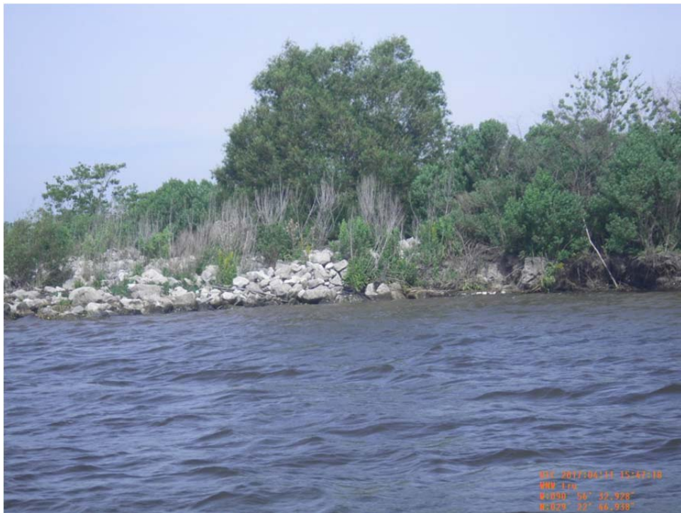
Photo No.22 – view of the north bank riprap tie-in on Structure 21.