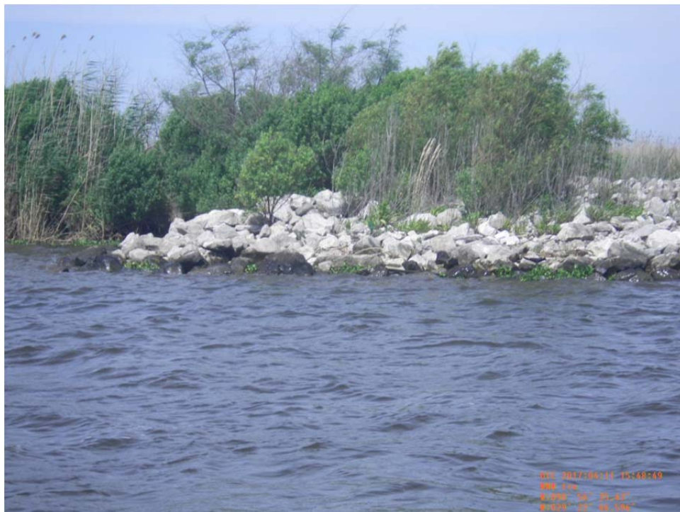
Photo No.24 – view of the south bank riprap tie-in on Structure 21.