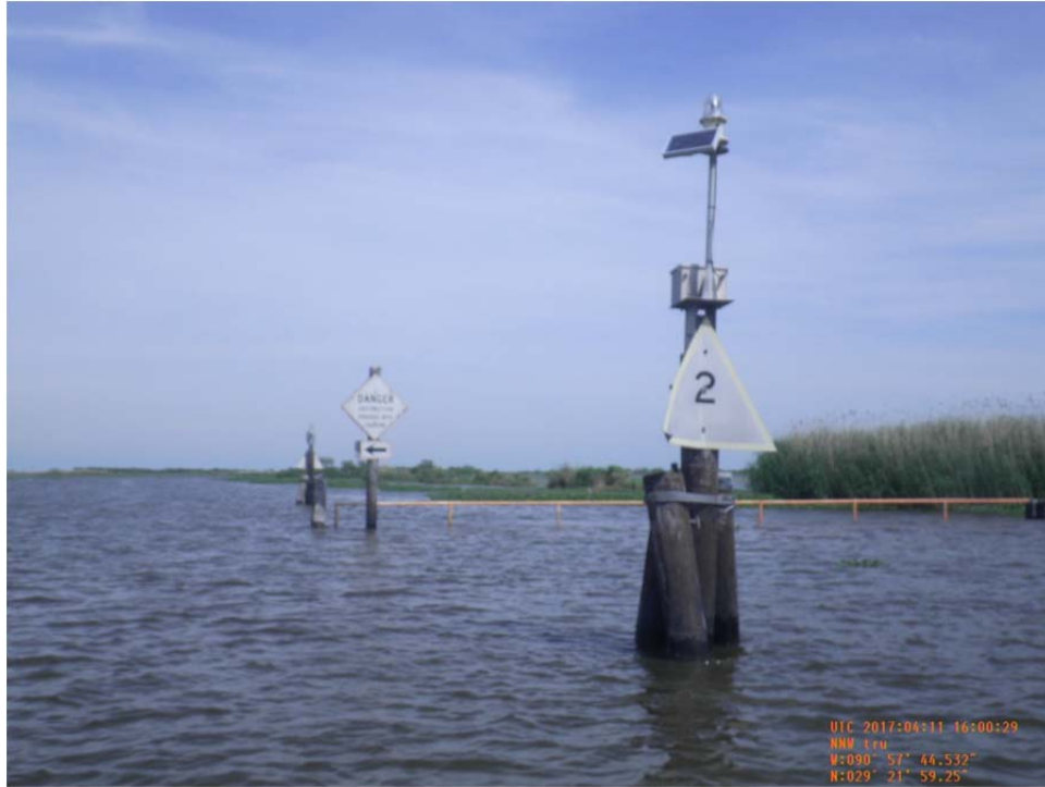
Photo No. 33 – view of the warning signs and navigational aids at the entrance of the barge bay at Structure 6.