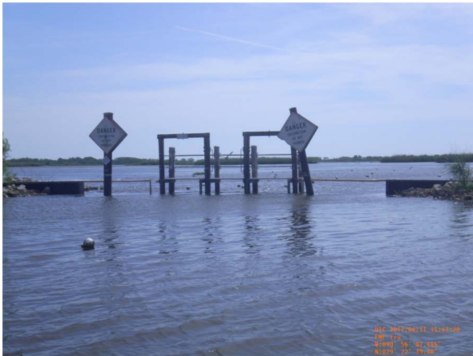
Photo No.16 – view of Structure 23 located along the east bank of Jug Lake.