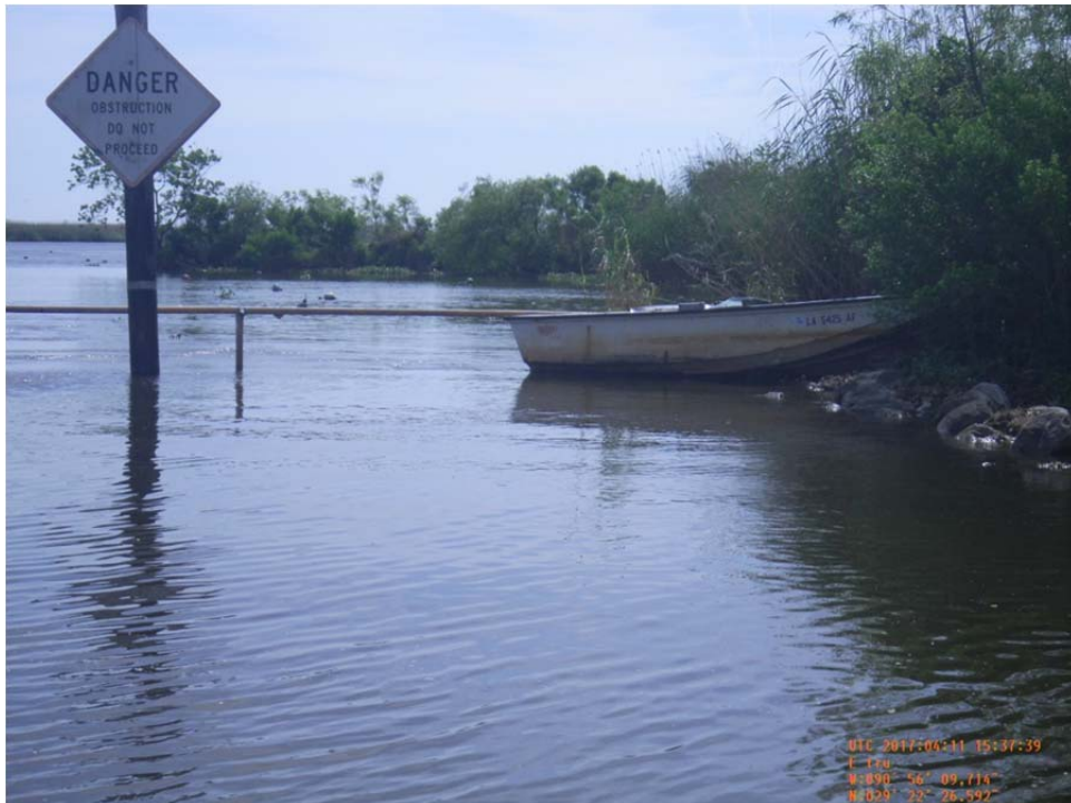
Photo No.12 – view of the south bank rip rap tie-in of Structure 24 and abandoned boat hull.