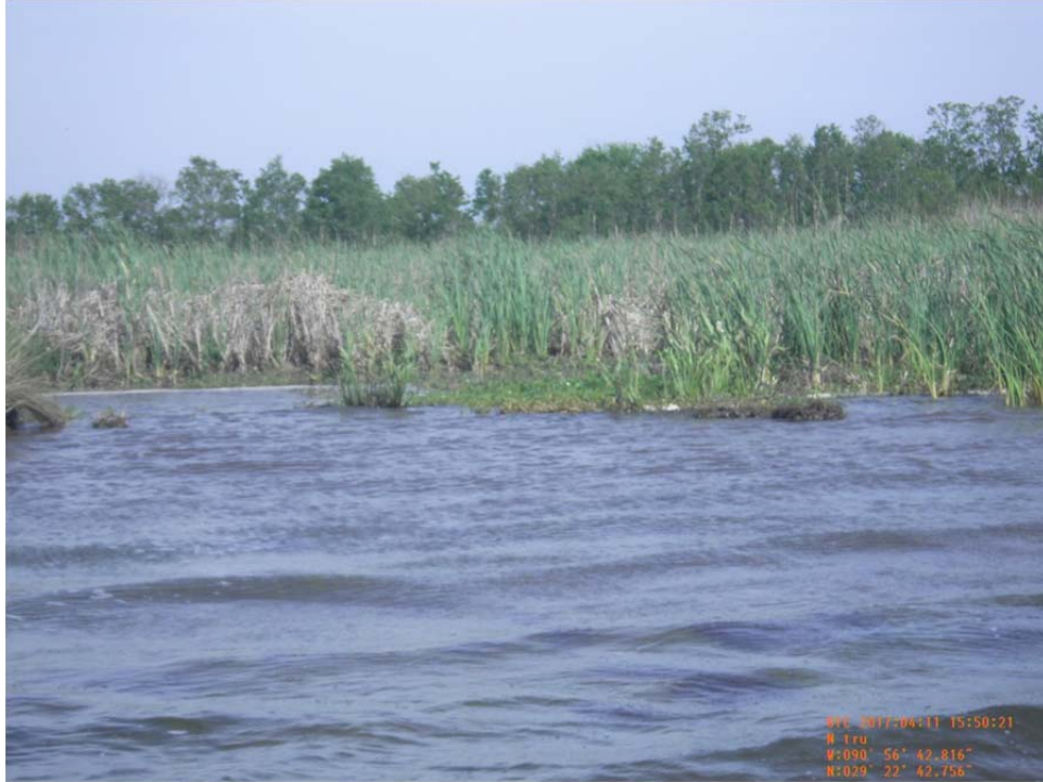
Photo No.27 – view of the existing shoreline along the north bank of Jug Lake between Structures 21 and 20.