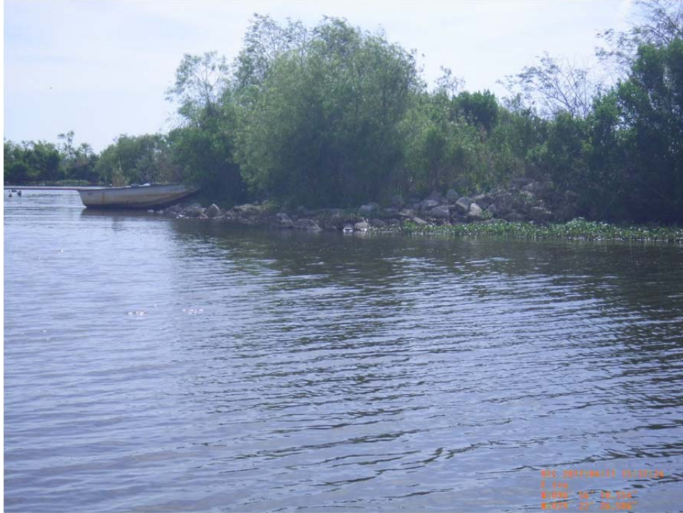
Photo No.11 – view of the south bank rip rap tie-in of Structure 24.