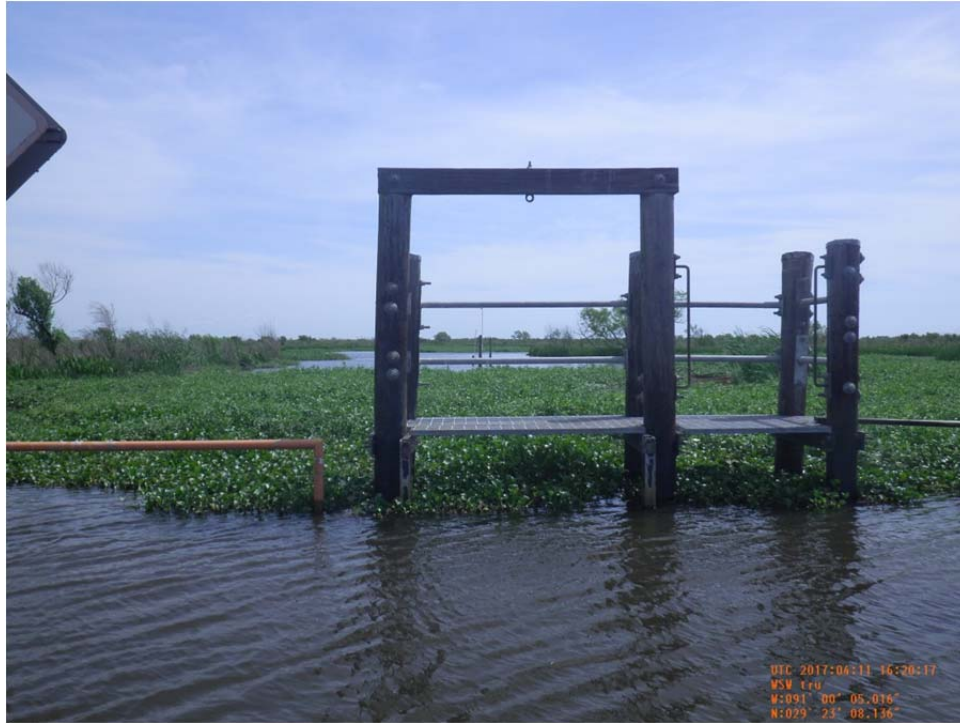
Photo No.47 – view of variable crest weir structure 14 and interior marsh.