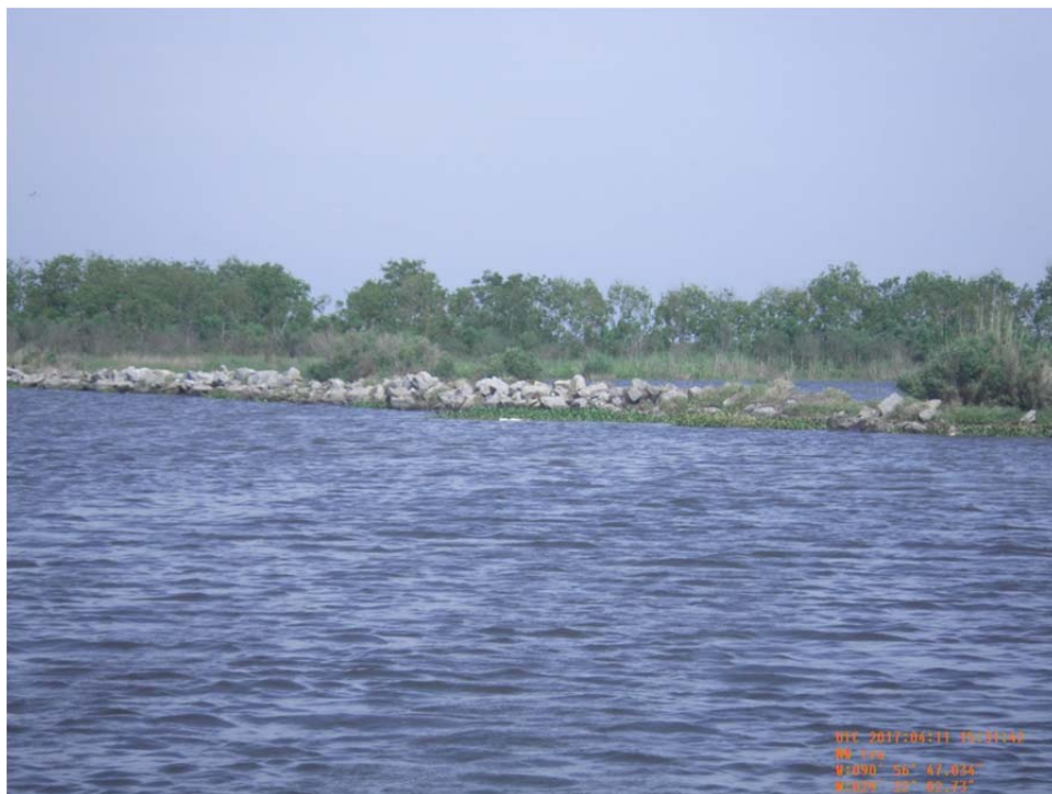
Photo No.8 – view of the rock dike shoreline repair (Breach Repair 1-4) located along the north bank of Bayou de Cade.