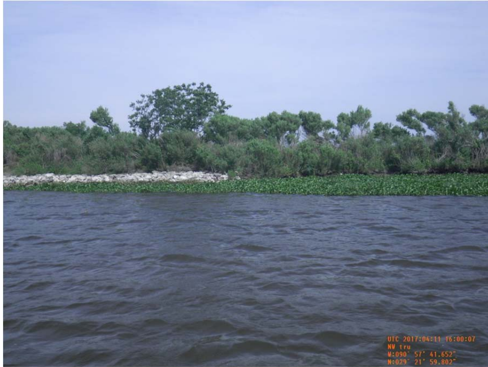
Photo No. 31 – view of the rock revetment along north bank of Bayou Decade west of Jug Lake.