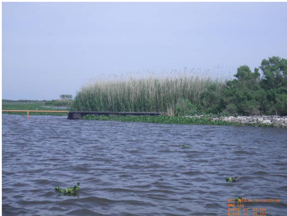
Photo No.32- view of the steel sheetpile to bank tie-in on the east side of Structure 6.