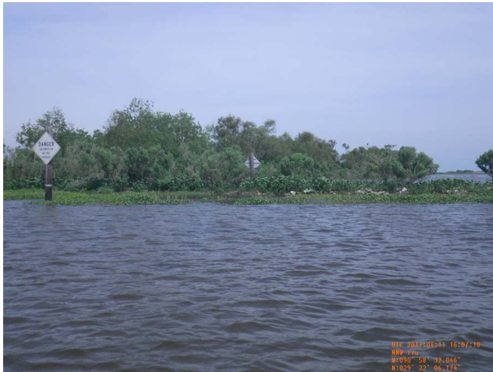
Photo No.39 – view of rock plug 7 along the north bank of Bayou de Cade.