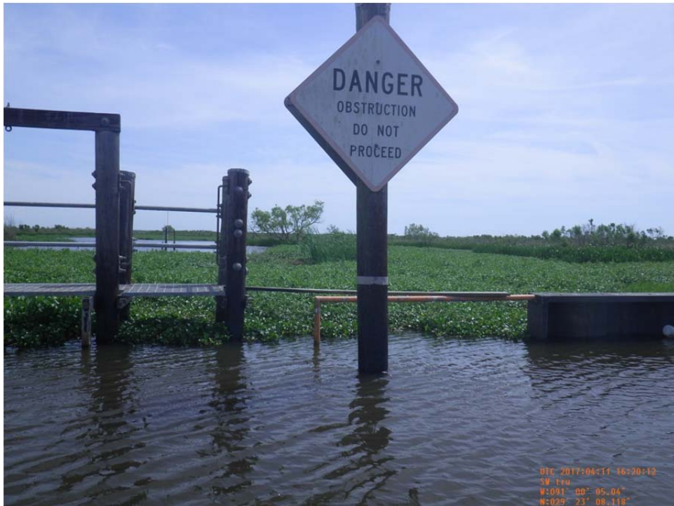
Photo No.46 – view of variable crest weir structure 14 and interior marsh.