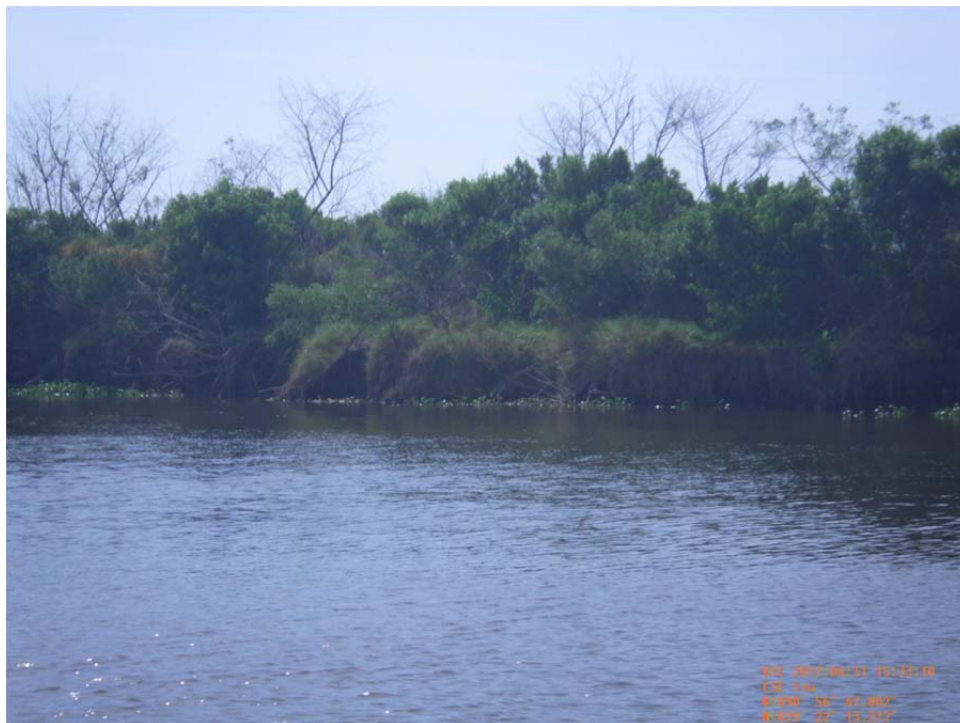
Photo No.10 – view of the earthen embankment along the south bank of Jug Lake.