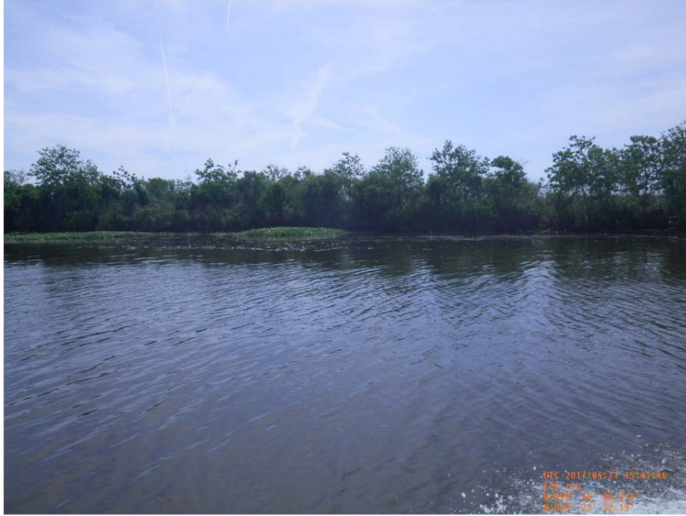
Photo No.15 – view of the earthen embankment along the south bank of Jug Lake between Structure 24 and 23.