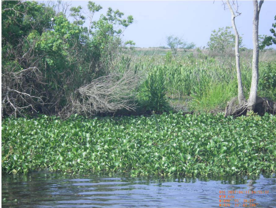
Photo No.1 – view of small opening in the bank line along Turtle Bayou between Bayou De Cade and Superior Canal.