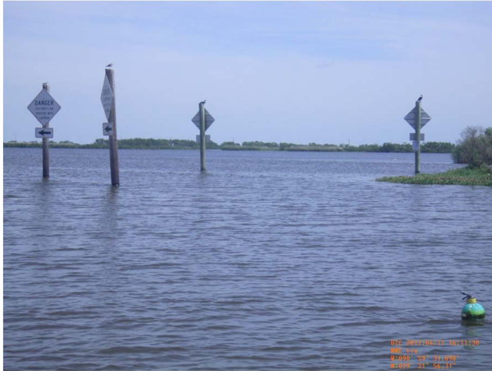
Photo No.43 – view of rock channel liner and warning signs at Structure 10 along the east bank of Voss Canal.