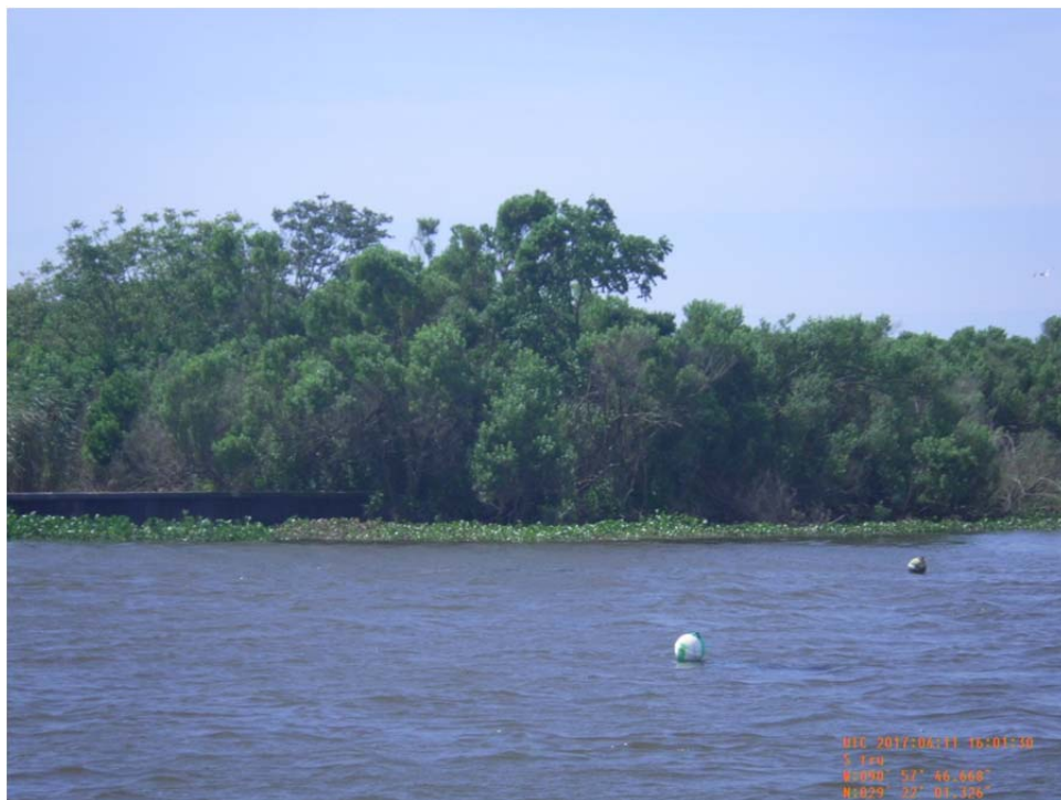
Photo No. 34 – view of the steel sheetpile to bank tie-in on the west end of Structure 6