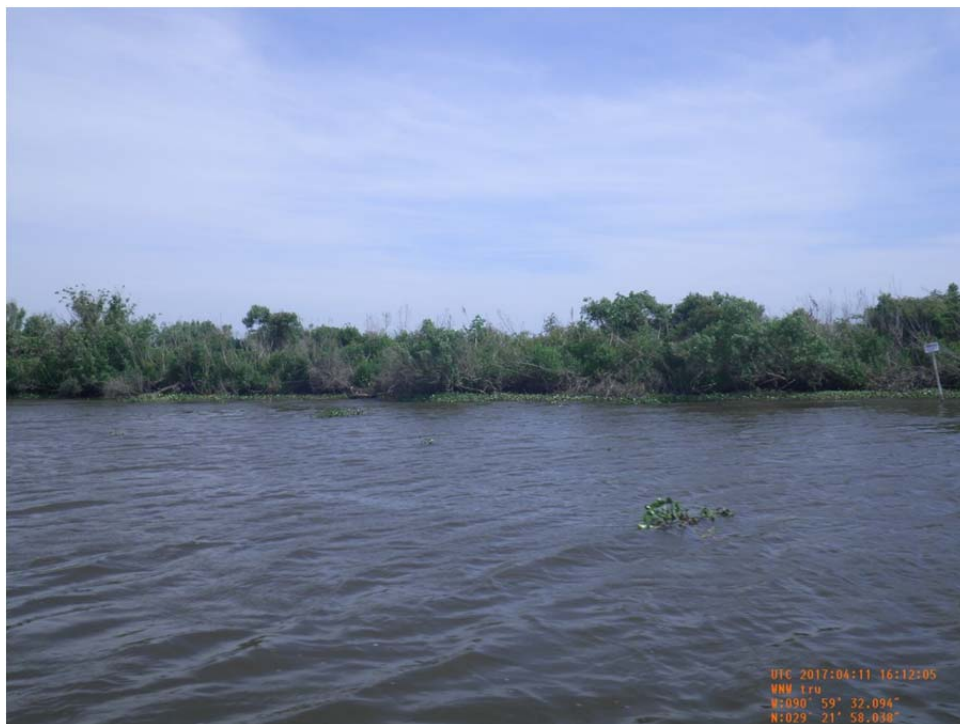
Photo No. 44- view of existing embankment along the east bank of Voss Canal .