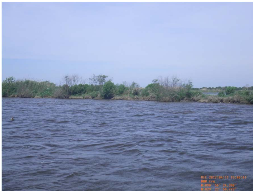
Photo No.20 – view of the earthen embankment along the north bank of Jug Lake east of Structure 21.