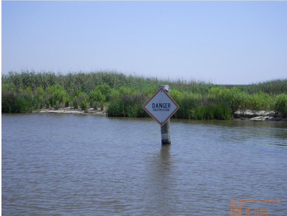
Photo 21: View of the warning signs in front of the articulated concrete mats along Bayou Raccourci