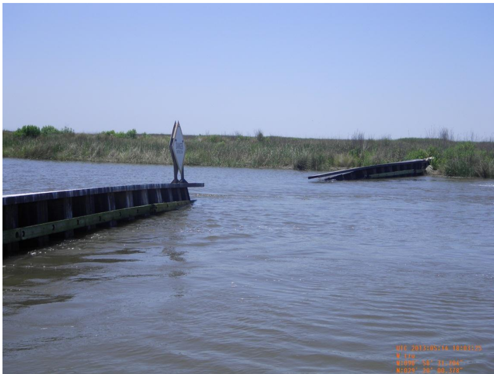
Photo 40: View of structural damage to Sheetpile Plug 2 caused by Hurricane Isaac, looking west