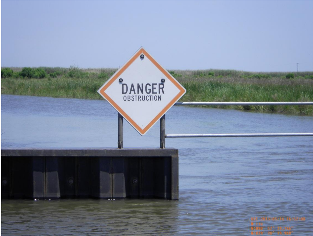
Photo 27: Close-up view of the warning signs on top of the Sheetpile Weir, looking north