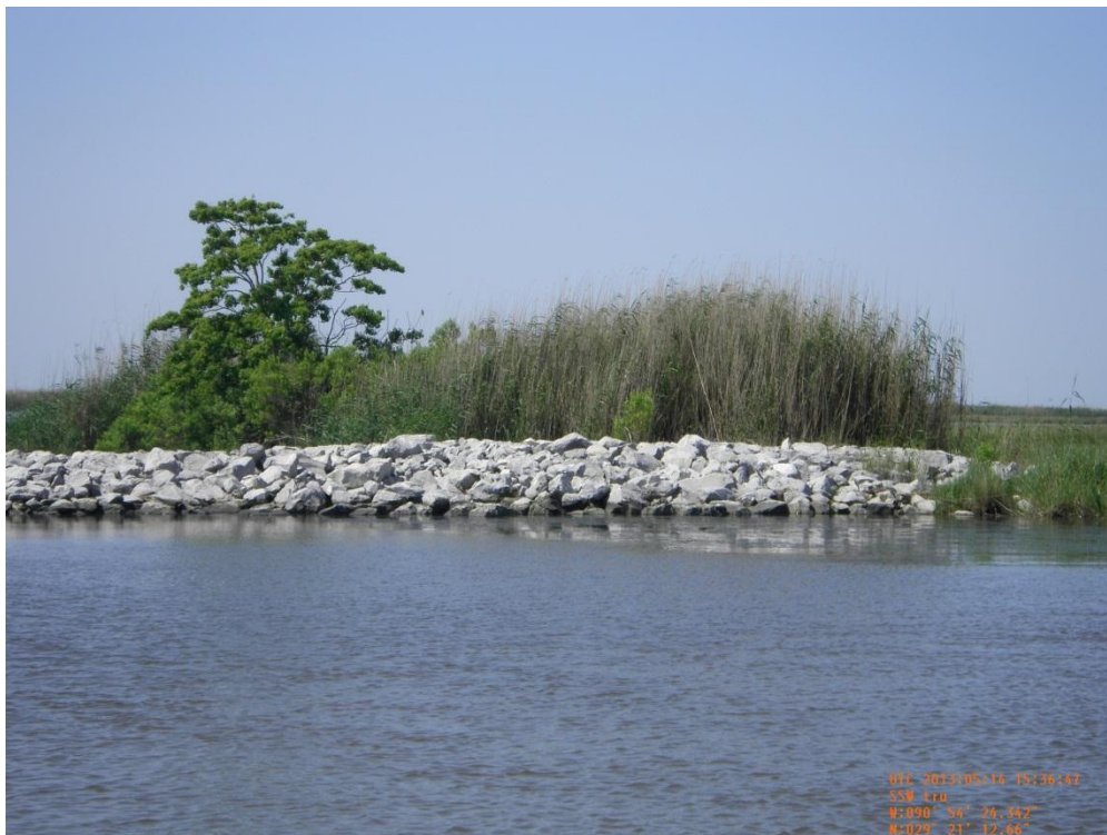
Photo 8: View of the western embankment tie-in of Rock Plug 1, looking south