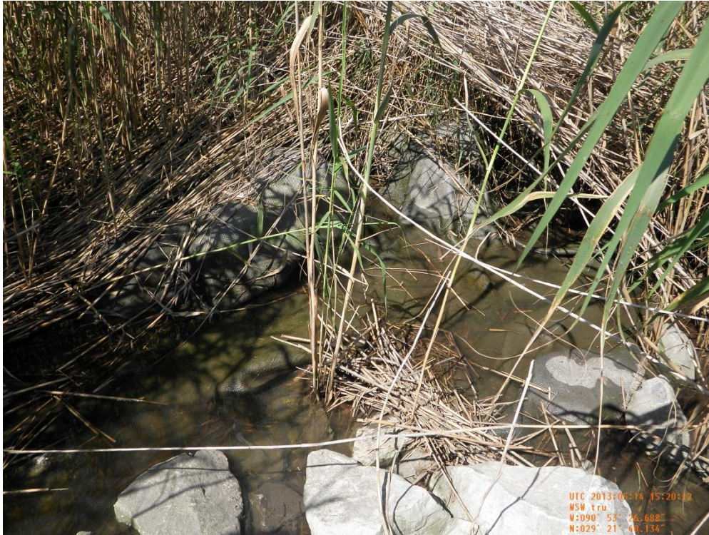
Photo 3: View of standing water and untrimmed geo-fabric on the southern end of Rock Plug 2