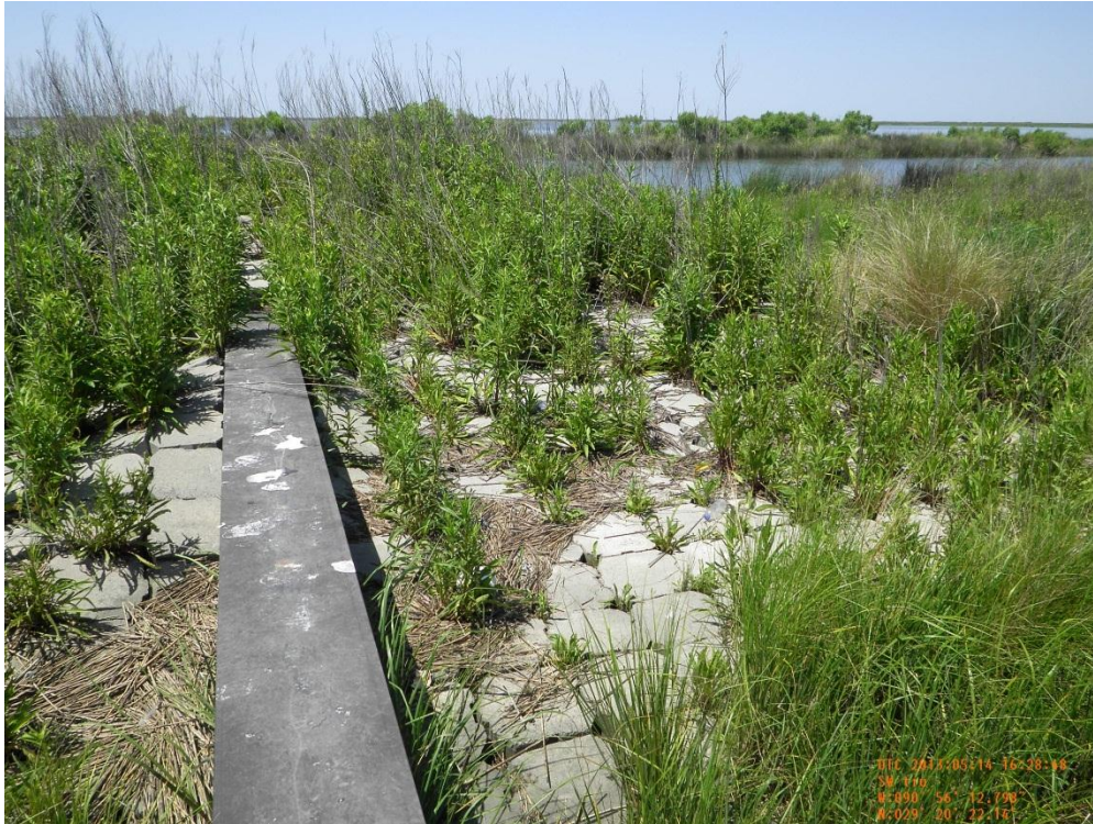
Photo 17: View of the articulated concrete mat used on the southwestern embankment tie-in on Sheetpile Plug 3 from on top of the structure