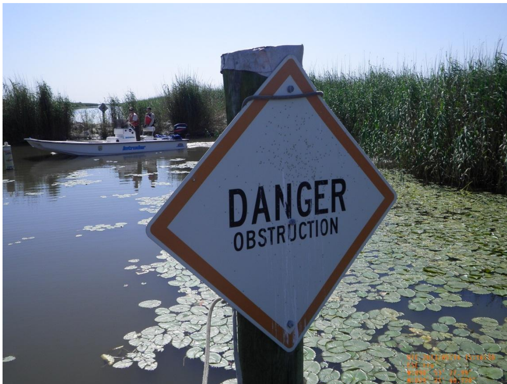
Photo 2: Close up view of Rock Plug 2 warning sign and damage caused by vandals