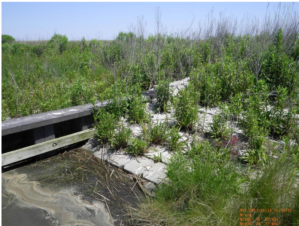
Photo 14: View of the articulated concrete mat used on the northeastern embankment tie-in of Sheetpile Plug 3