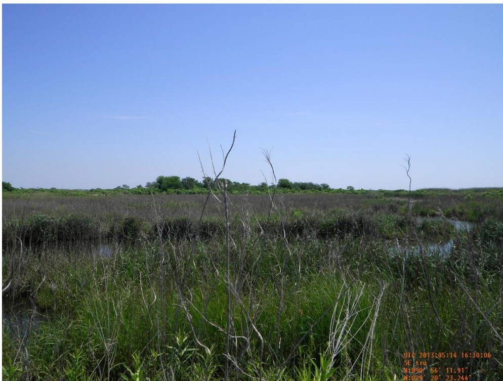
Photo 18: View of Fill Area 7 from Sheetpile Plug 3, looking northeast