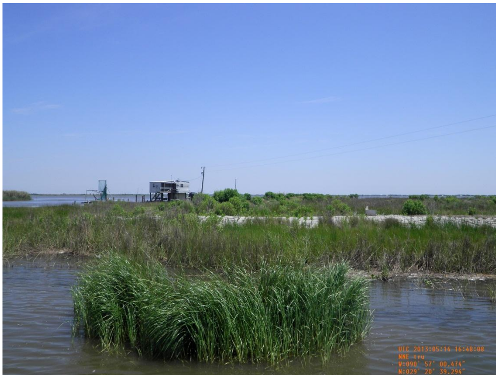
Photo 24: View of the articulated concrete mats along the northern end of Bayou Raccourci