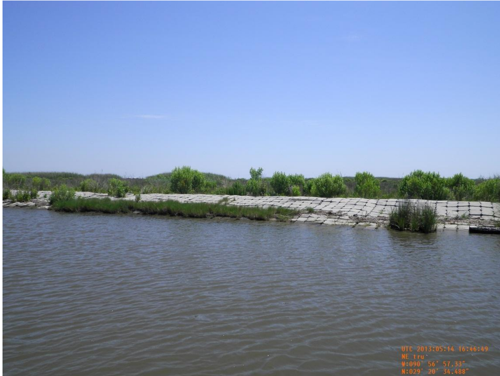
Photo 23: View of the articulated concrete mats along the eastern bank of Bayou Raccourci, looking east