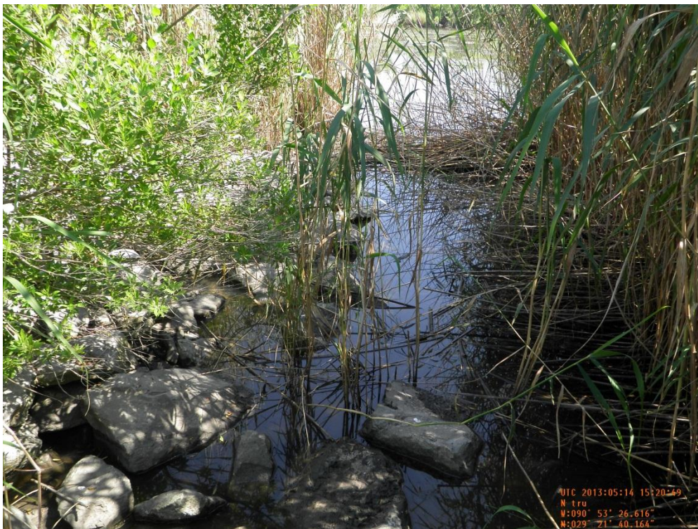
Photo 4: View of standing water and untrimmed geo-fabric on the southern end of Rock Plug 2