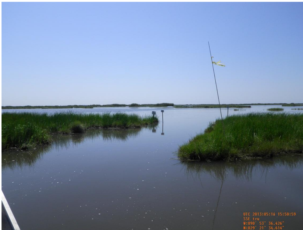
Photo 12: View of a breach in the southern bank of Small Bayou Lapointe, looking south. It is located between Earthen Plug 2 and Rock Plug 2.