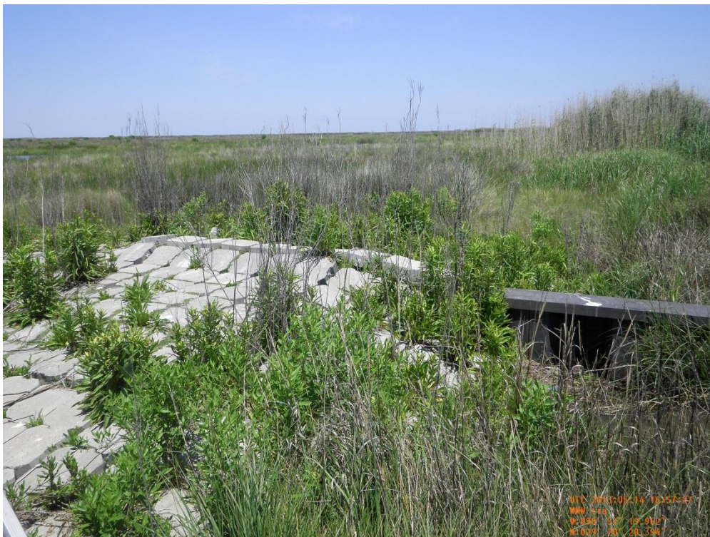
Photo 28: View of the articulated concrete mat used on the western embankment tie-in of the Sheetpile Weir, looking northwest