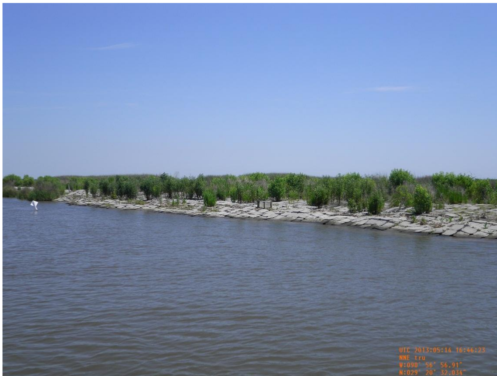
Photo 22: View of the articulated concrete mats along the eastern bank of Bayou Raccourci, looking east