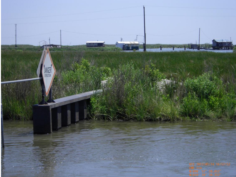
Photo 29: View of the articulated concrete mat used on the eastern embankment tie-in of the Sheetpile Weir, looking northeast