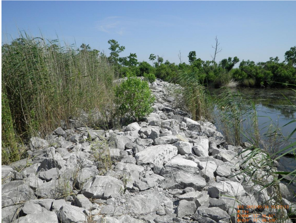
Photo 5: View of Rock Plug 2 from on top of the structure, looking north