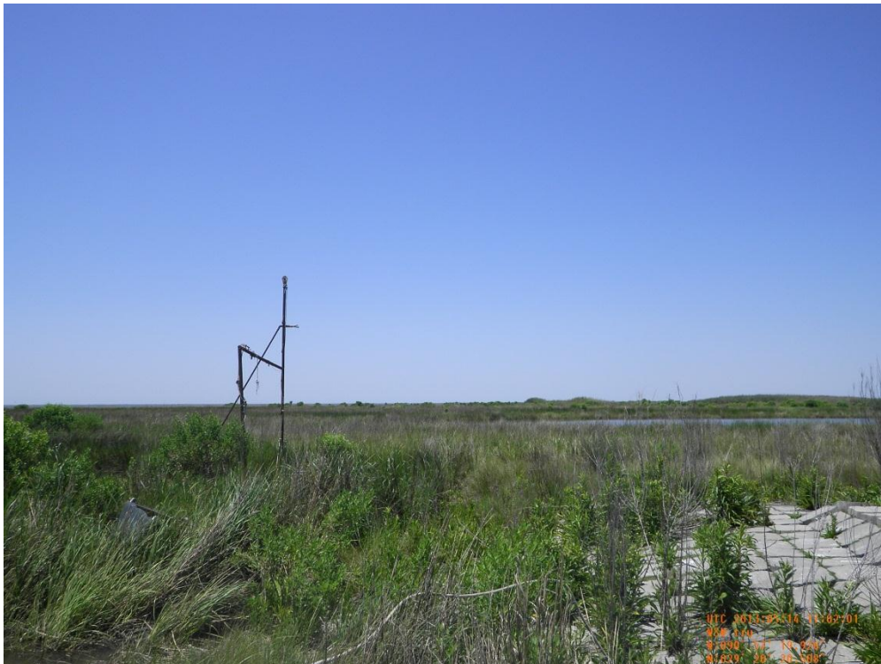
Photo 30: View of Fill Area 4 from the Sheetpile Weir, looking west