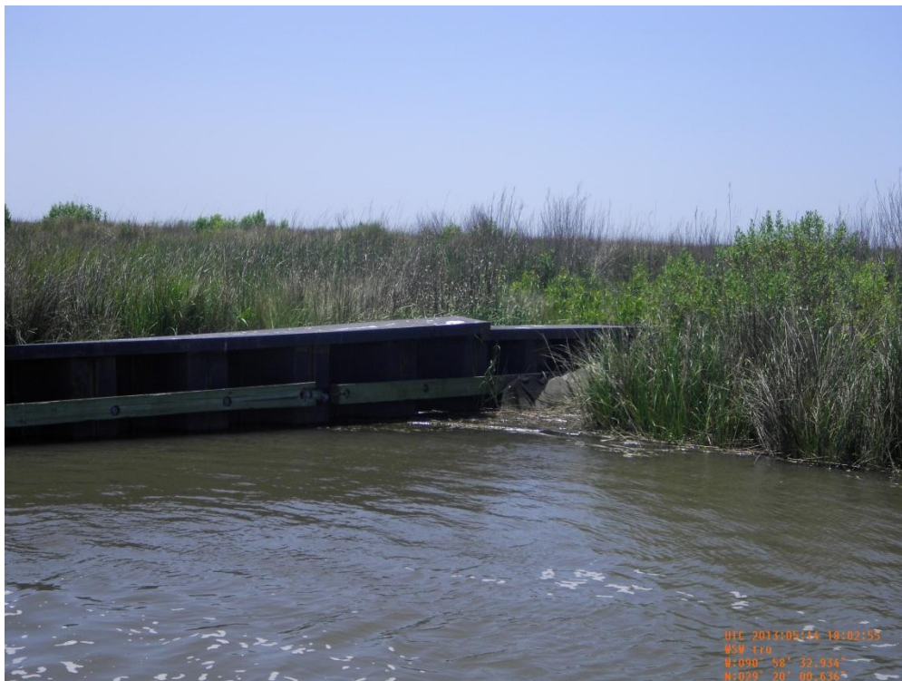
Photo 38: View of western embankment tie-in of Sheetpile Plug 2, looking west