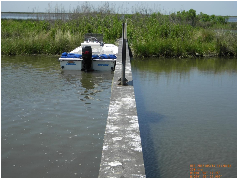
Photo 16: View along Sheetpile Plug 3 from on top of the structure, looking southwest