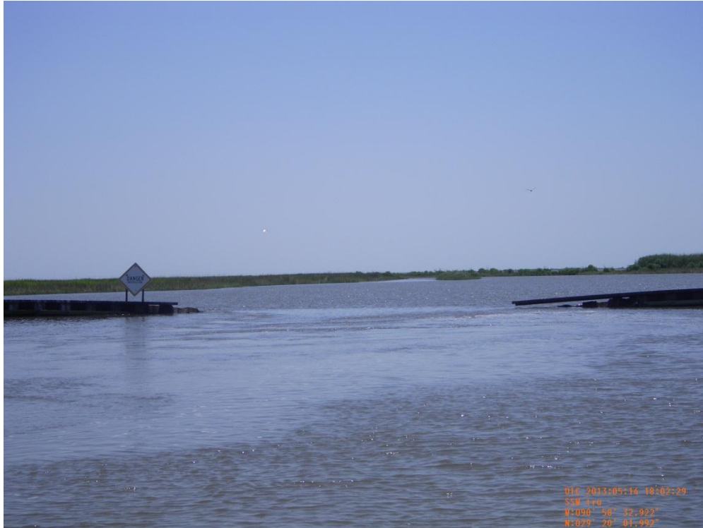
Photo 37: View of structural damage to Sheetpile Plug 2 caused by Hurricane Isaac, looking south