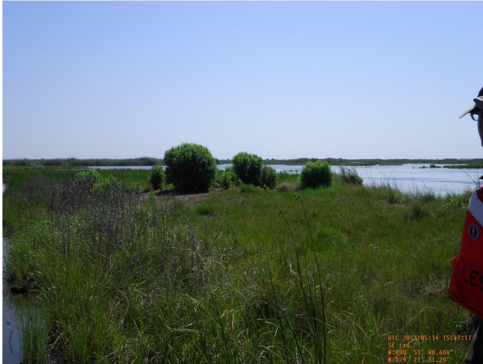
Photo 11: View of the eastern embankment tie-in of Earthen Plug 2, looking east