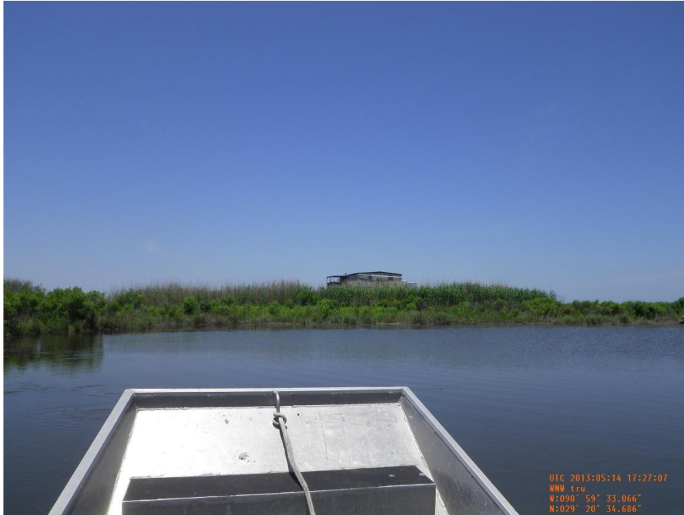
Photo 31: Overall view of Earthen Plug 1 from the Y canal, looking northwest