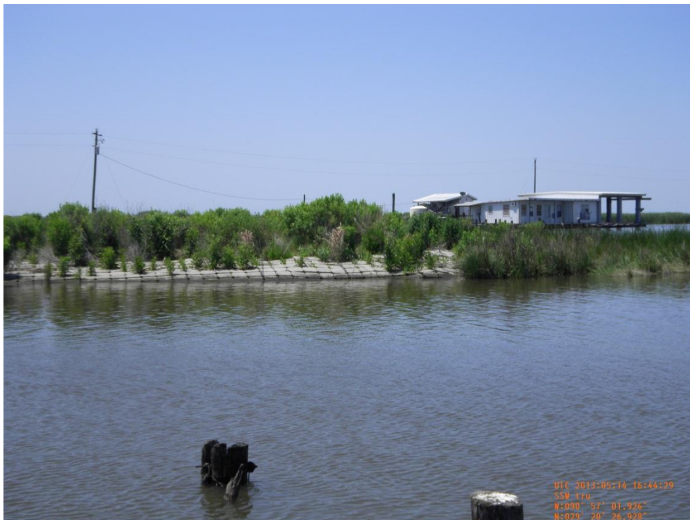
Photo 20: View of the articulated concrete mats along the southern end of Bayou Raccourci