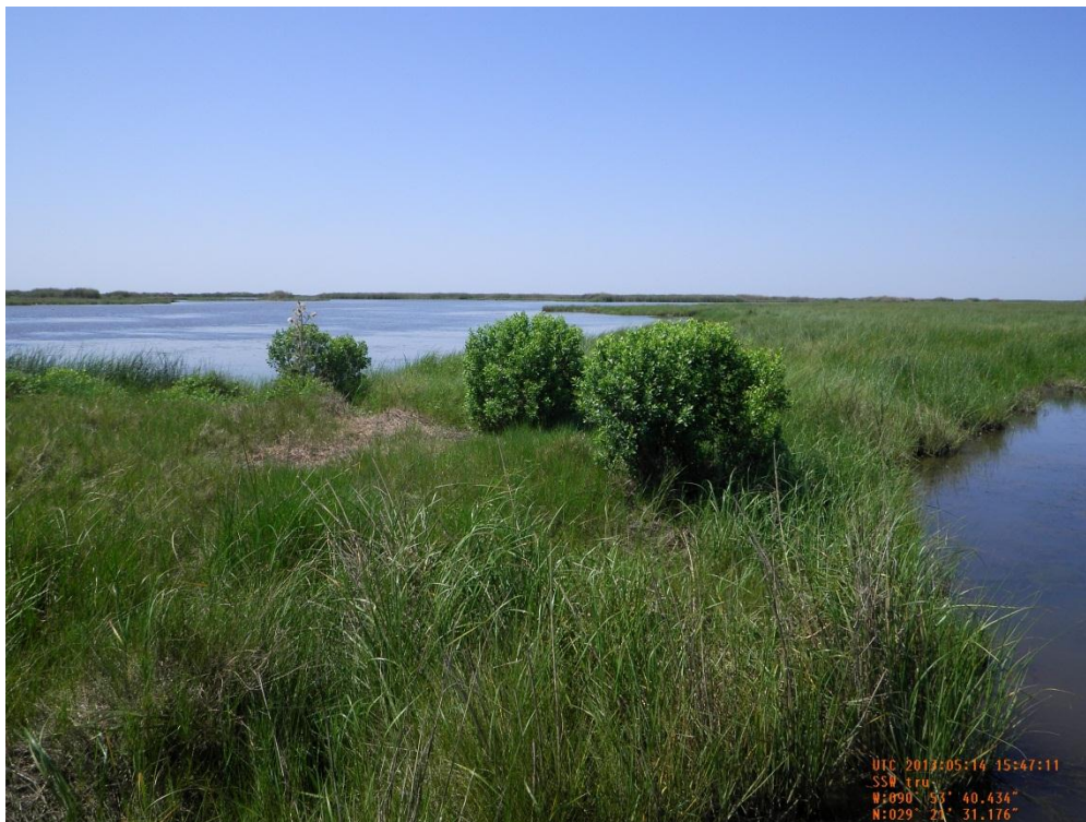
Photo 10: View of the western embankment tie-in of Earthen Plug 2, looking west