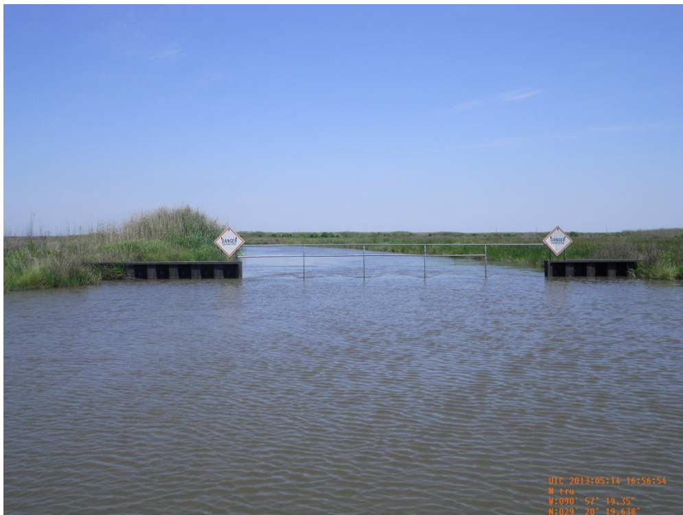
Photo 26: Overall view of the Sheetpile Weir replacement, looking north