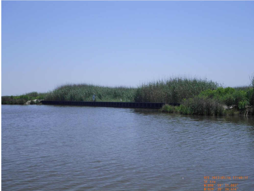
Photo 33: Overall view of Sheetpile Plug 1 from the Y canal. Looking south