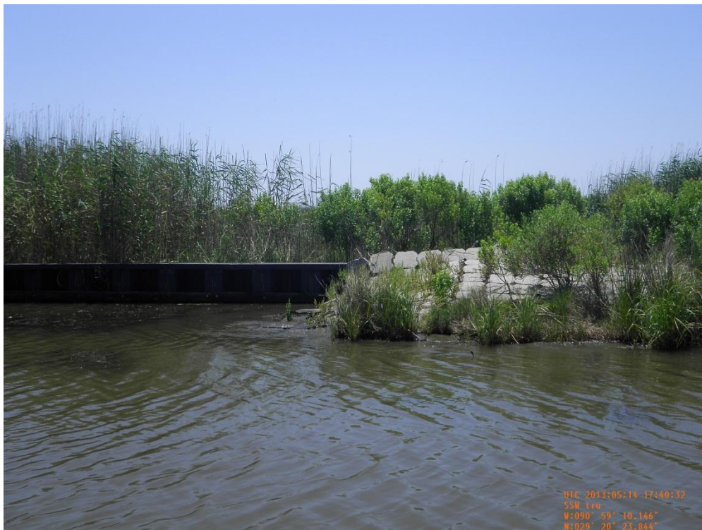
Photo 34: View of the articulated concrete mats used on the western embankment tie-in of Sheetpile Plug 1, looking south