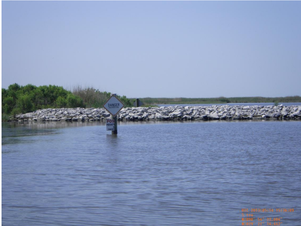
Photo 7: View of the eastern embankment tie-in and warning sign of Rock Plug 1, looking south