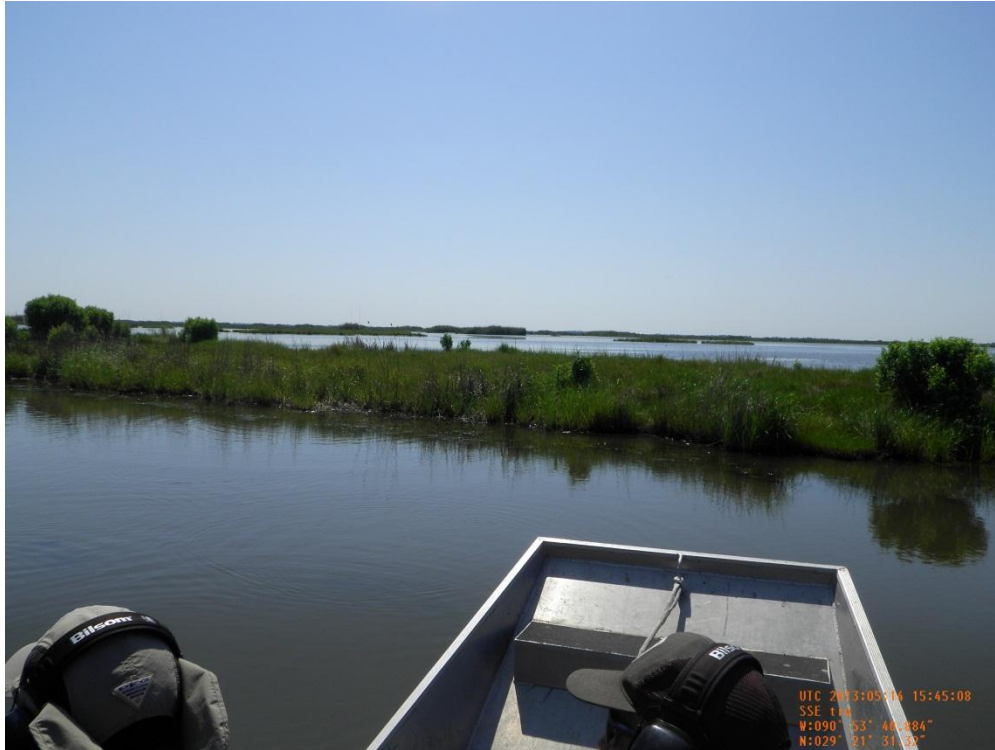
Photo 9: Overall view of Earthen Plug 2 from Small Bayou Lapointe, looking east