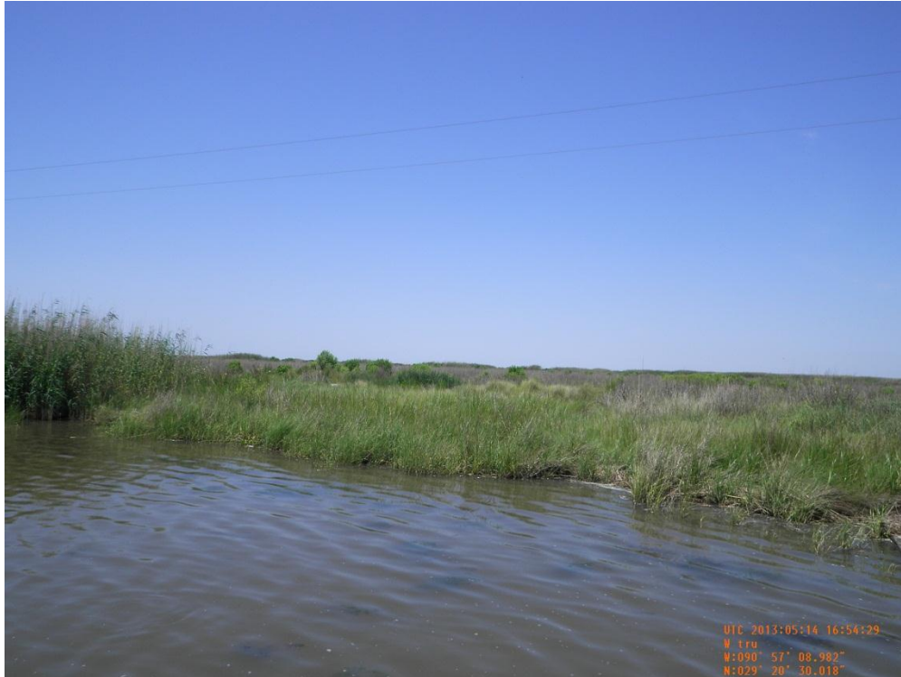
Photo 25: View of Fill Area 5 from the western bank of Bayou Raccourci, looking west