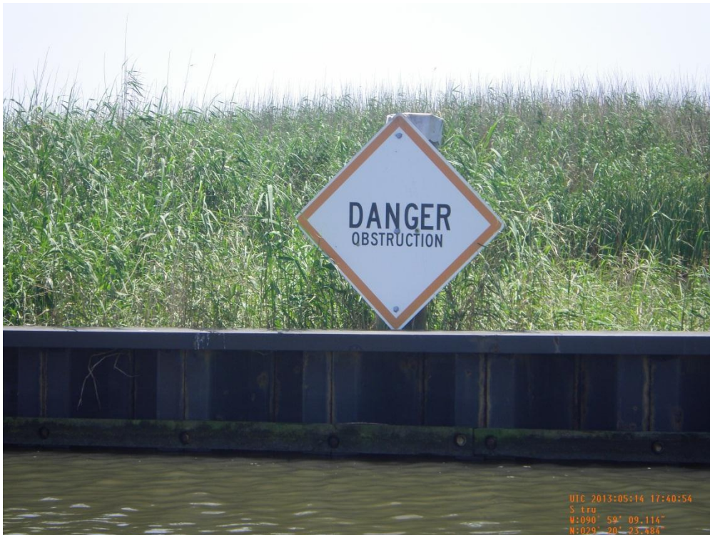
Photo 36: View of the warning sign installed on top of Sheetpile Plug 1, looking south