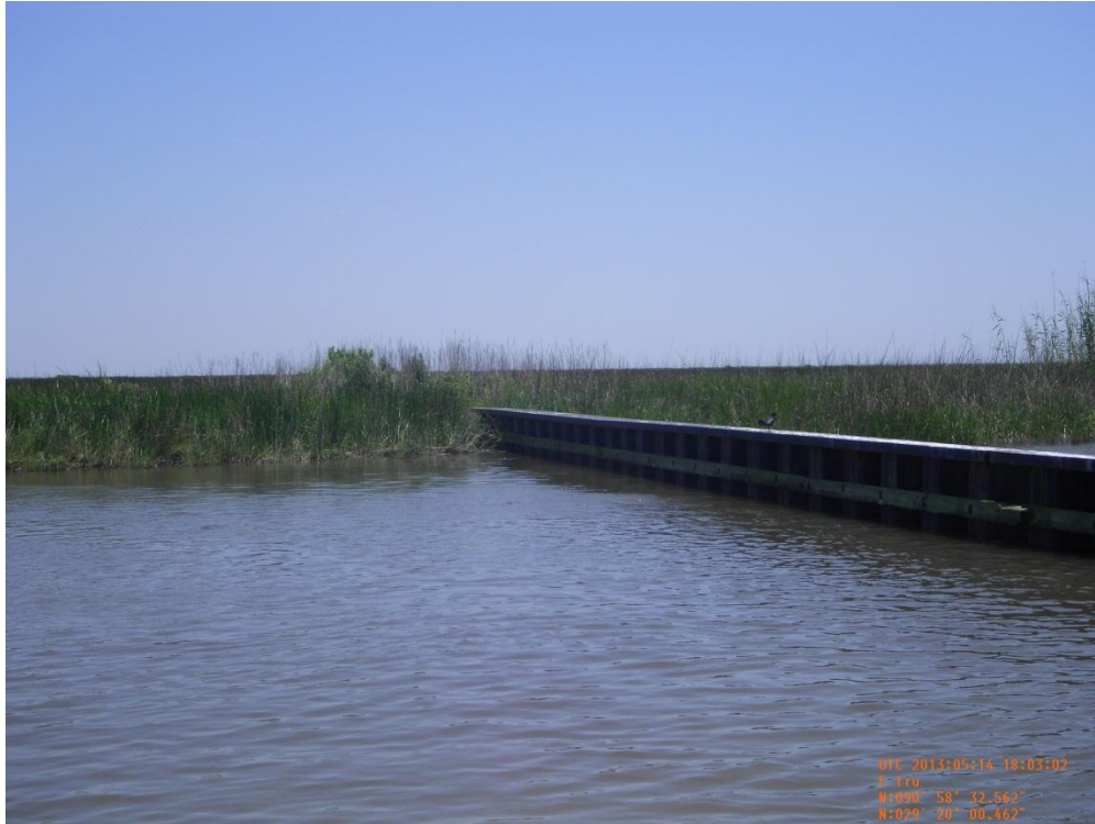
Photo 39: View of eastern embankment tie-in of Sheetpile Plug 2, looking east