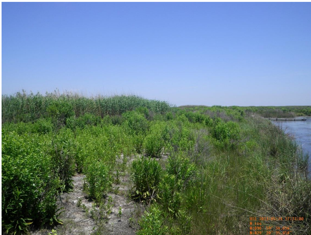
Photo 32: View along Earthen Plug 1 from on top of the plug, looking north