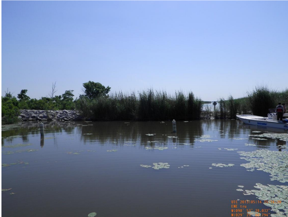
Photo 1: Overall view of Rock Plug 2 from the oilfield canal, looking east