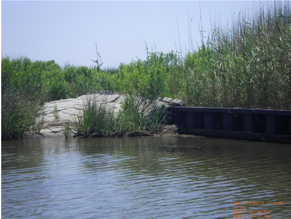
Photo 35: View of the articulated concrete mats used on the eastern embankment tie-in of Sheetpile Plug 1, looking south