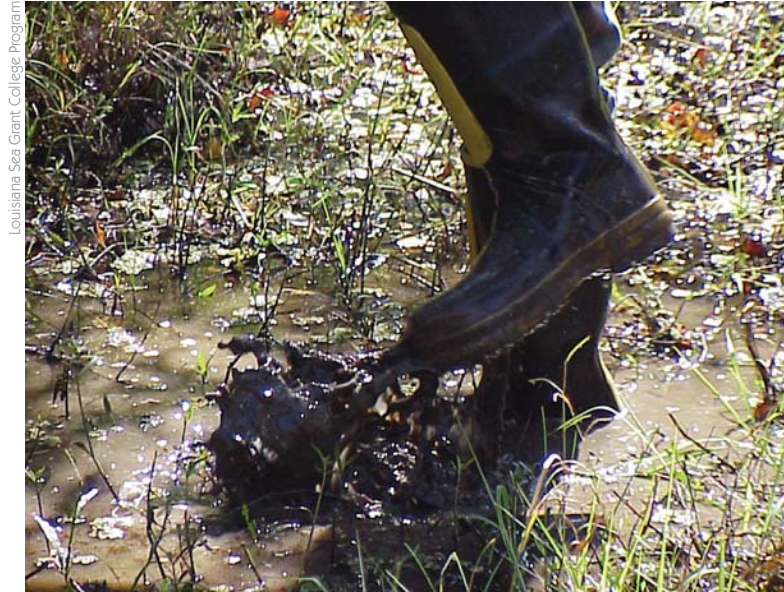
The unconsolidated soil of Louisiana’s wetlands can feel bottomless — in many places one can sink chest-deep in mud before there is enough solidity underfoot to arrest the plunge. The difficulty of establishing seedlings in such conditions spurs scientists to devise other planting methods.

Having done his share of digging in knee-deep water, Ron Boustany went back to the lab to search for other planting methods. In a recent study he grew submersed aquatic plant seedlings on biodegradable mats in a greenhouse. He then transplanted the seedlings