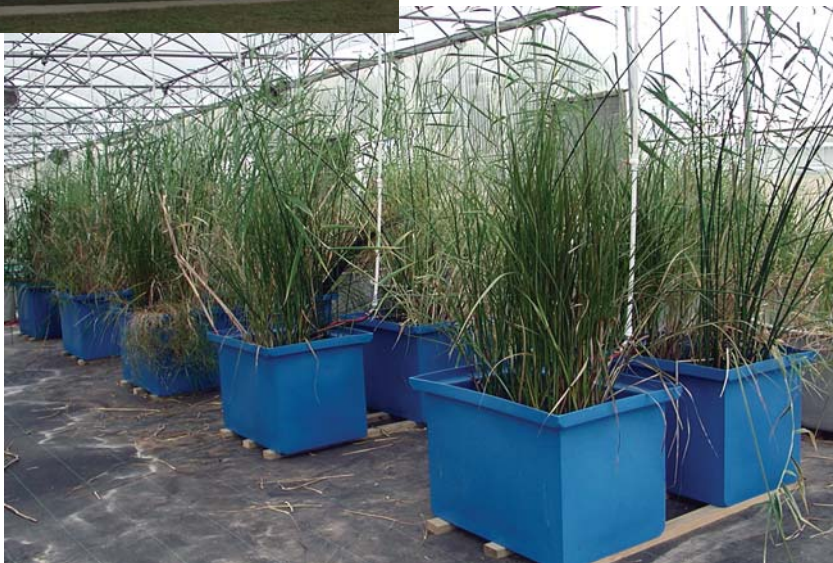
Top: Research in the labs and greenhouses at NWRC not only helps Louisiana fight wetlands loss, but also contributes to understanding the complexities of wetland ecosystems worldwide.