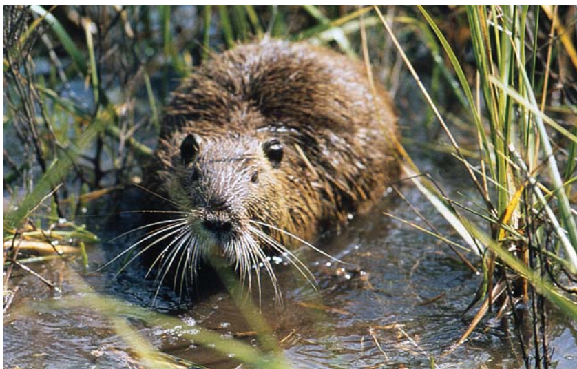
National Wetlands Research Center

"Think of sediment in a new CWPPRA project as