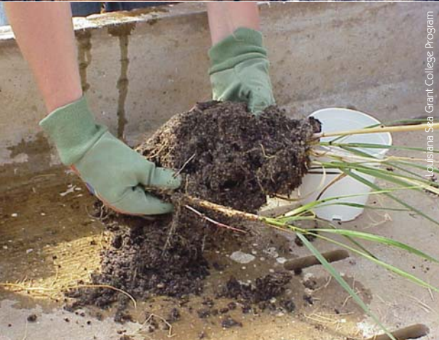
Above: New propagation methods aim to reduce the expense of growing material for transplanting and transporting it to project sites.