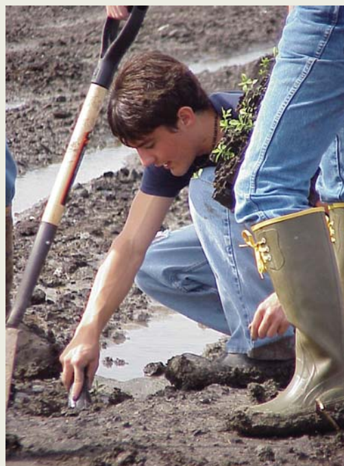
Louisiana Sea Grant College Program

Coastal Roots is administered by the Louisiana Sea Grant College Program and supported by the LSU Agricultural Center, BTNEP, Louisiana DNR, National Oceanic and Atmospheric