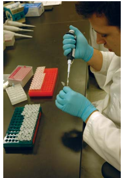
National Wetlands Research Center