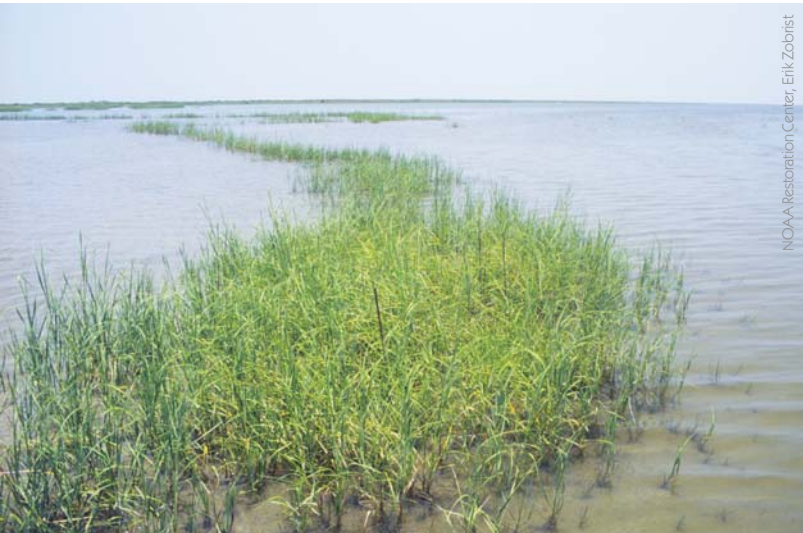
NOAA Restoration Center, Erik Zobrist

Because the ecosystem of Louisiana’s marshes is so destabilized, plants need help to save the wetlands. Many projects funded by the Coastal Wetlands Planning, Protection and Restoration Act (commonly known as the Breaux Act) involve engineering, such as designing water control structures to regulate tidal flow, stabilizing shorelines