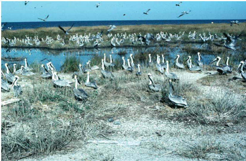
Thanks to habitat restoration projects in coastal Louisiana, the brown pelican is no longer on the U.S. Fish and Wildlife Service's endangered species list.